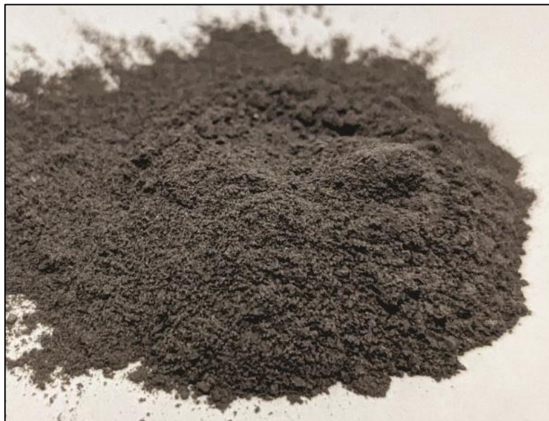
Figure 1: Antimony sulphide (37% Sb) precipitated from leach liquor

Importantly antimony sulphide (with grade of 37% Sb, see full results Appendix 2) has been precipitated from the leach liquor, demonstrating that the feasibility of a simple metallurgical process of leaching the copper-antimony-silver float concentrate, to remove the antimony and then to precipitate it as a high-grade product.