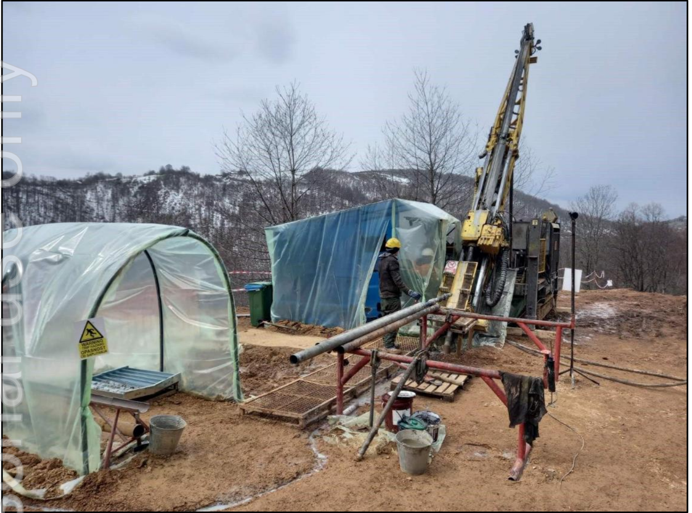
Figure 2. Photo of the sixth diamond rig set-up at Gradina.