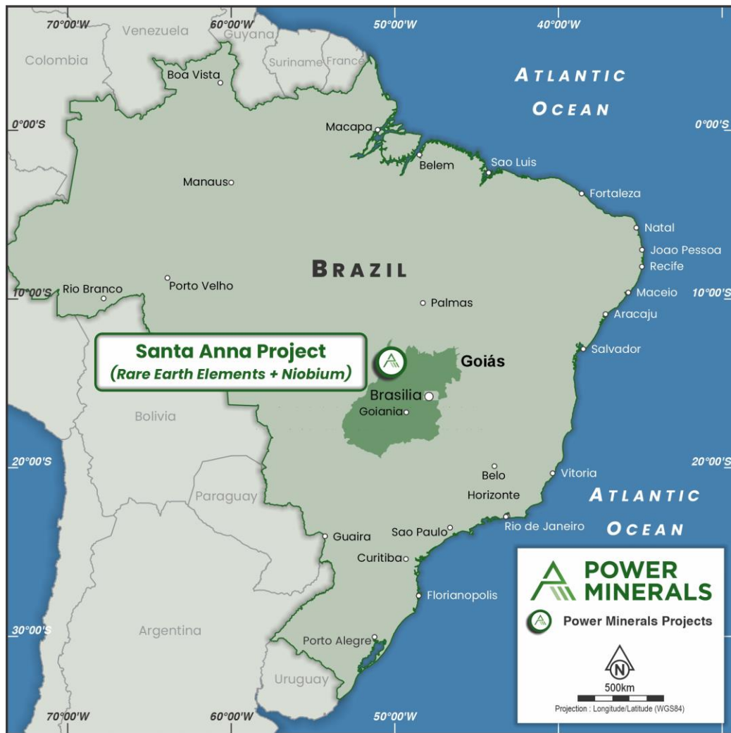
Figure 1. Santa Anna Project location map in Goiás State, central Brazil.

The newly discovered Santa Anna project is located in Goiás State at the Catalão Complex.