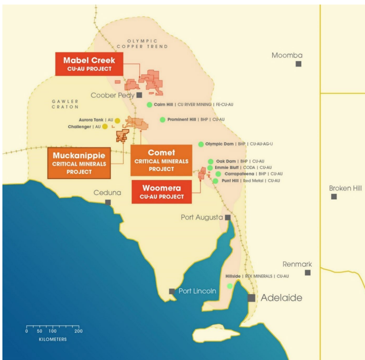
PTR's Project Locations in South Australia

The Company has two major exploration projects in the world-class Olympic Copper-Gold Province of South Australia. Work in the region has uncovered Iron-Oxide Copper-Gold style alteration/mineralisation at both its Mabel Creek and Woomera Project Areas. Geophysical targeting work has defined several compelling Tier-1 Copper-Gold targets which the Company is aiming to drill test during the 2025 calendar period.