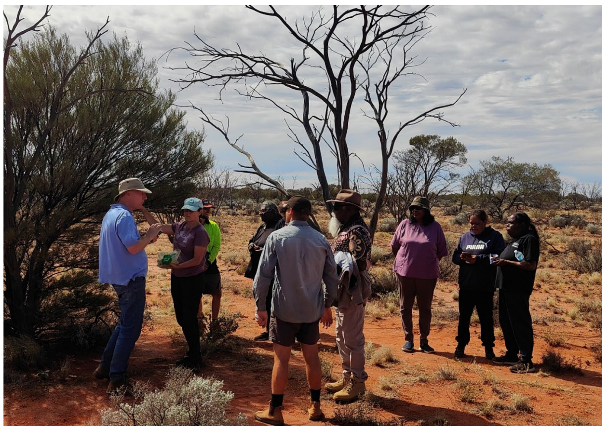
Photo 2: Members of the Cultural Heritage Surveying Team, April 2025, Rosewood North Prospect