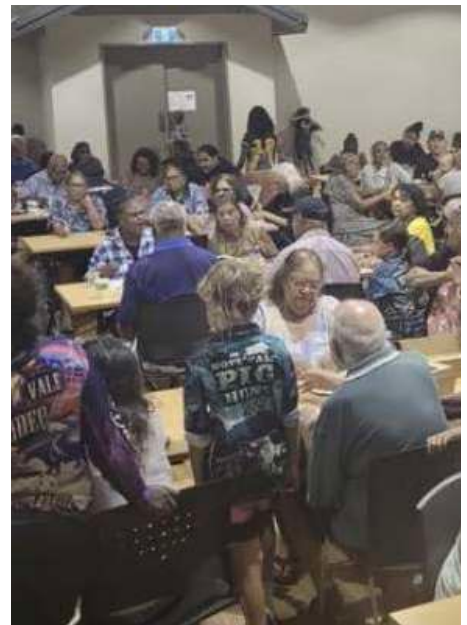
Diatreme’s community engagement activities in Hope Vale, Qld