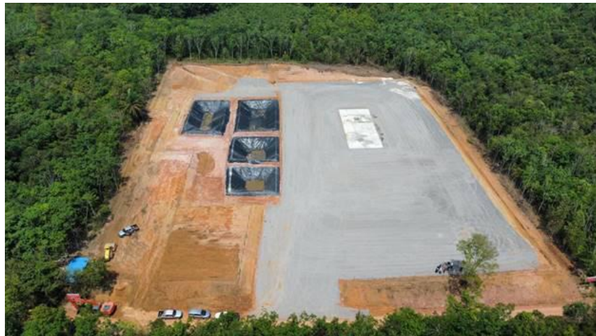
Figure 2: Bunian 6 Well pad

The well pad construction has been completed with the flowline laid to the edge of the location.