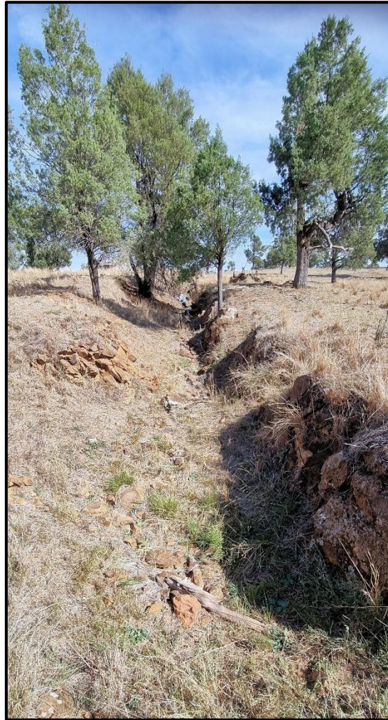
Figure 3 – Nibblers Hill - Historical costean