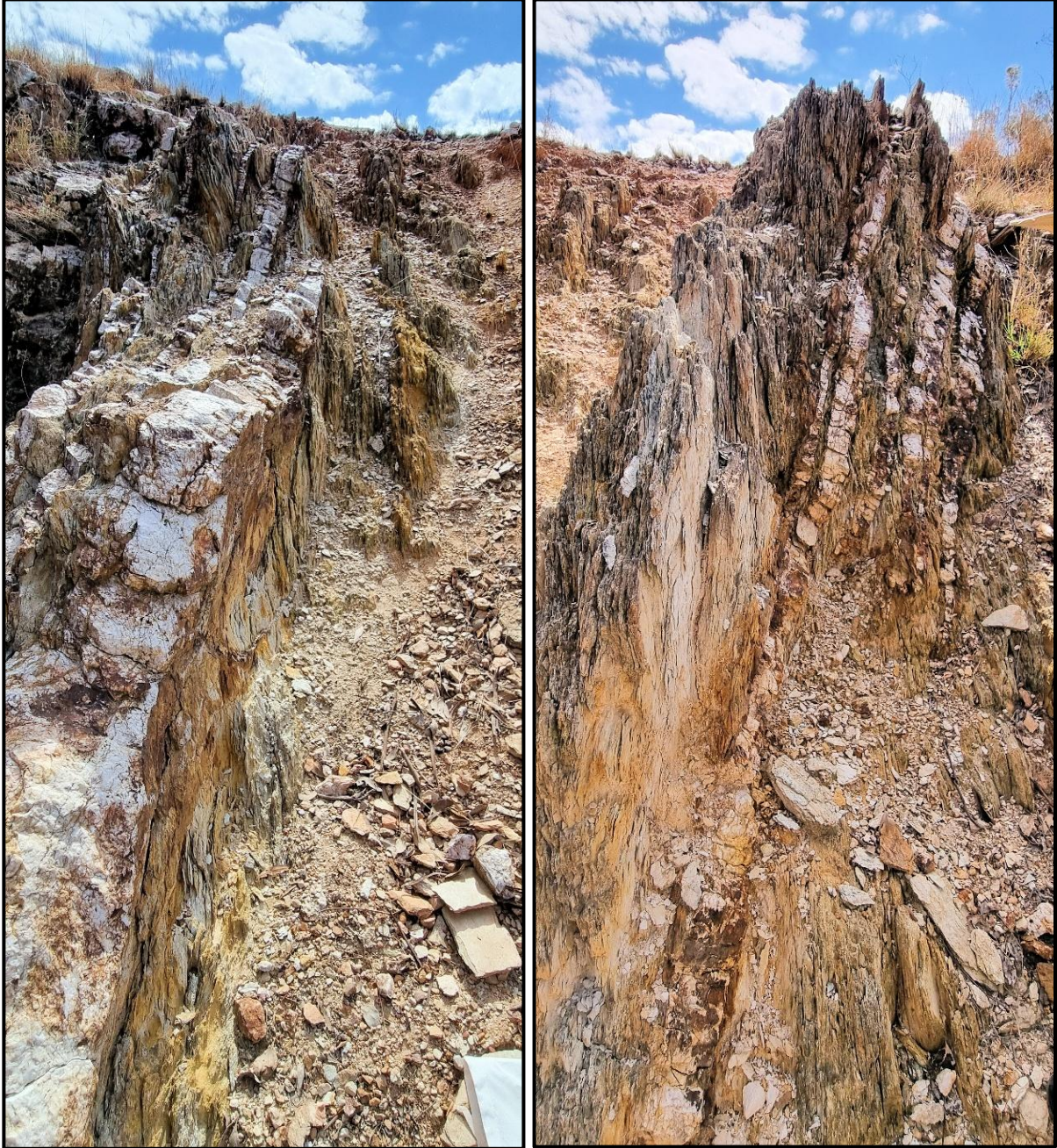
Figure 2 – Mary's Dream - Qtz veining in sheared siltstones