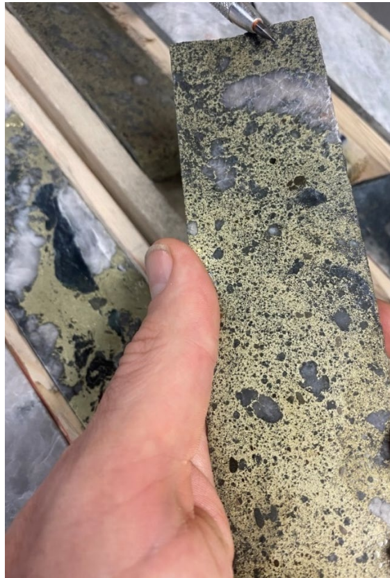
Figure 2: High grade drill core from CB-24-100 intersecting 7.3m @ @ 4.2% Cu, 0.3g/t Au & 16.6g/t Ag at Corner Bay. Image showing core between 321.9m and 322.6m.