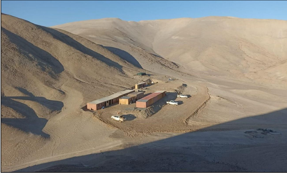
Figure 2: Camp construction completed at the Cangallo Porphyry Copper Project