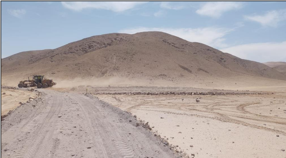
Figure 3: Access preparation completed at the Cangallo Porphyry Copper Project