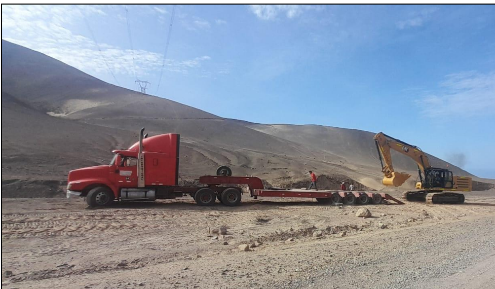
Figure 4: Backhoe on site to prepare drill sumps at Cangallo