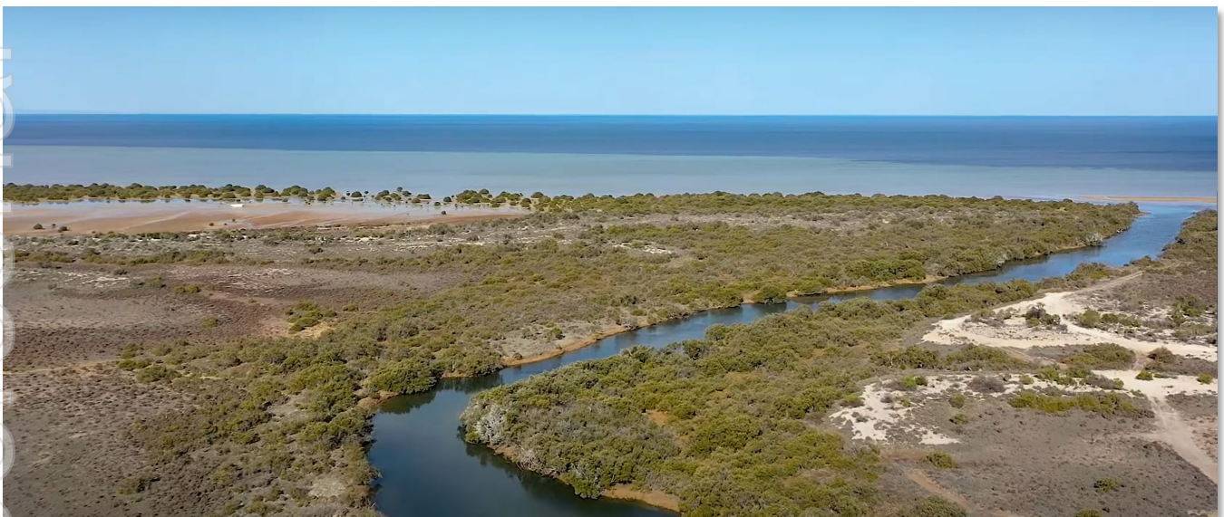
Terrestrial and marine environment, Mullaquana Station coastal zone, Upper Spencer Gulf

Locality of Jack Up Barge (JUB) SEA LIFT 1 at Mullaquana, progressing various offshore geotechnical drillholes for the proposed Northern Water desalination plant (position on 24 April 2025)