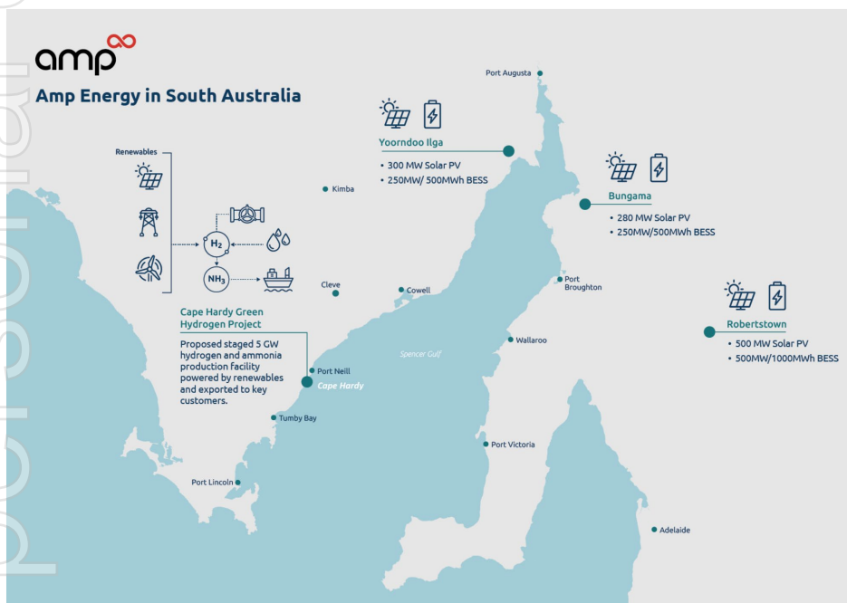
Amp Energy renewable energy projects in South Australia

Amp’s Cape Hardy Green Hydrogen project website provides general project information as well as detailed fact sheets relating to the met masts and the Renewable Energy Feasibility Permit (REFP) regulatory process. The Government of South Australia’s Department for Energy and Mining (DEM) notes Amp’s REFP application was lodged on 9 December 2024.