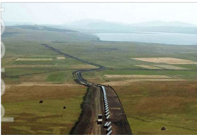
Pipeline construction within terrain similar to that traversed by the CEIP infrastructure corridor on the Eyre Peninsula.