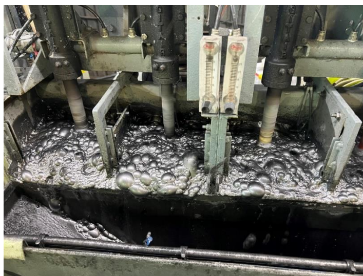
Figure 1: Flotation Cell producing graphite concentrate for bulk sample

Another important highlight was the dispatch of 5kg of graphite concentrate to ProGraphite GmbH in Germany. This sample will be used to assess the viability of producing spherical, purified graphite (SPG) from the Leliyn graphite concentrate. SPG is a pre-cursor for active anode material in Electric Vehicle and storage batteries.