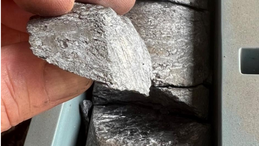
Figure 3: Graphitic Schist from LEDD_3 at 18.5m (interval 18-19m assayed 11.3% TGC)