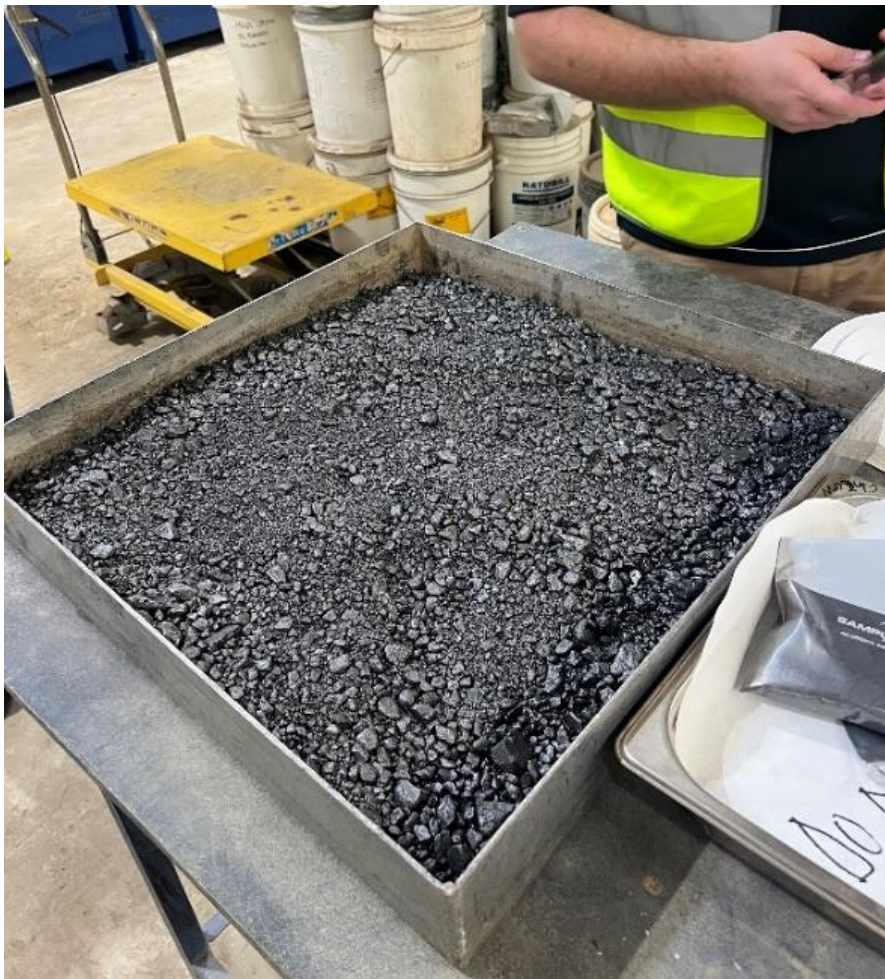
Figure 2: 5 kg sample of graphite concentrate ready for packaging and dispatch to Germany