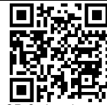
Scan QR Code using smartphone QR Reader App

PLEASE NOTE: For security reasons it is important you keep the above information confidential.