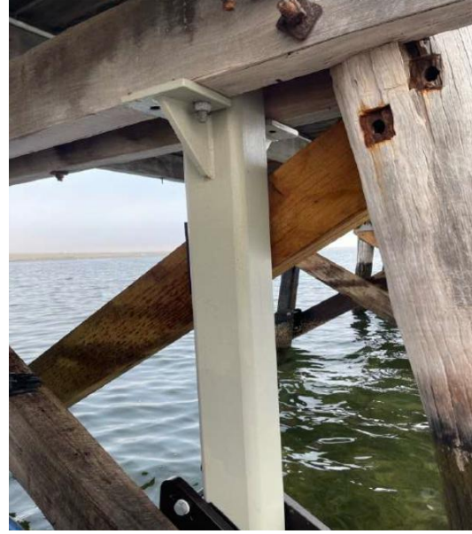
Figure 1: Trial inspection photos showing coatings performing well at the Streaky Bay Jetty, South Australia (April 2025)

Sparc has field trials underway with end users of significant scale across a number of operational environments. In addition to working with DIT, field trials are progressing with 29Metals, Santos and BHP Mitsubishi Alliance. The main purpose of the field trials is as follows: