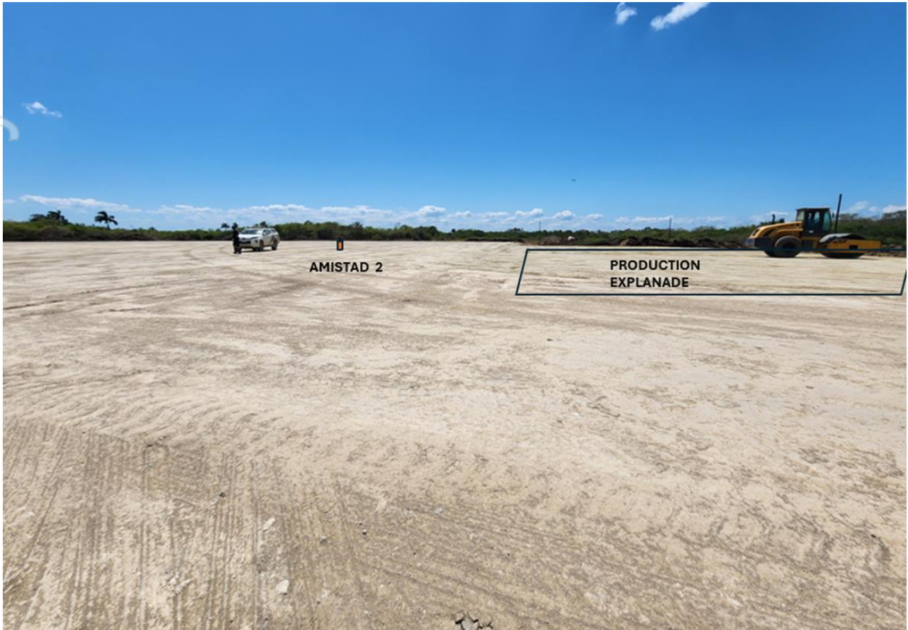
Figure 3 – Amistad-2 well pad (Pad-9).

Amistad-2 is scheduled to spud in the June quarter.