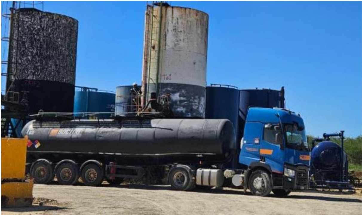
Figure 2 – Loading of Unit 1B crude oil to tanker at the Alameda-2 wellsite.