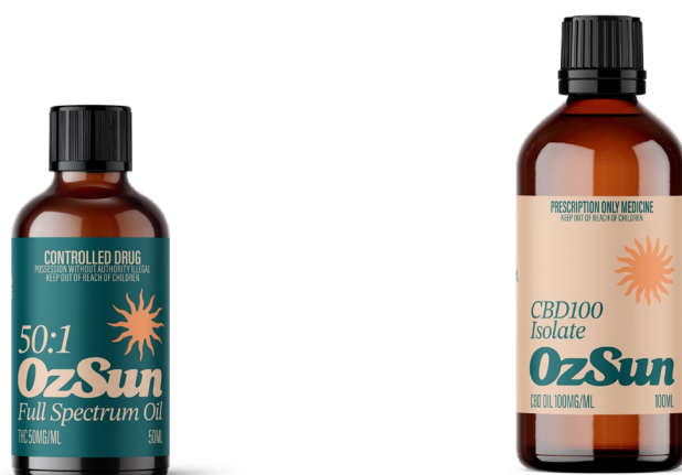
Figure v: New value-oriented product line, OzSun Medicinal Cannabis Oils

Following the success of the launch of OzSun flower as part of the Company's B2C strategy aimed at making medicinal cannabis more accessible, after Easter ECS will launch a new lower-priced product line, OzSun Medicinal Cannabis Oils. These oils will be supplied in larger volumes to cater for patients with chronic illnesses.