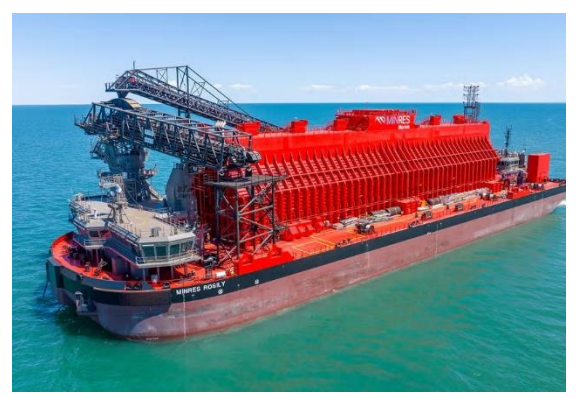
Fourth transhipper, MinRes Rosily