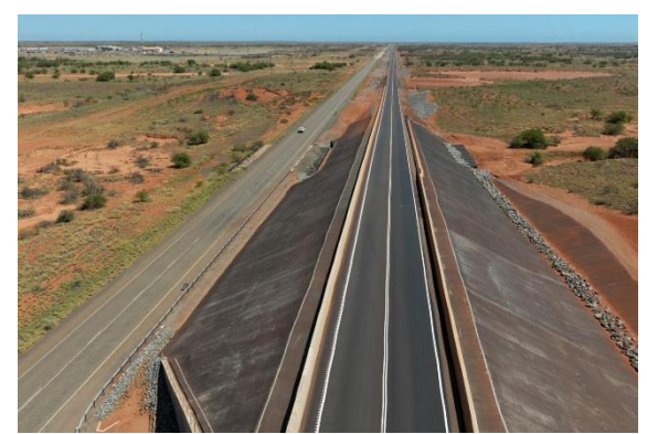
Upgraded section of Onslow Iron haul road