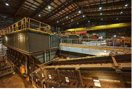
Road trains inside the port unloading facility