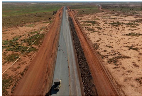
Haul road upgrade in progress