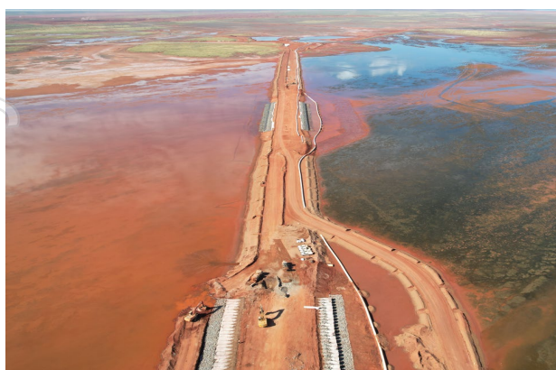
Figure 5: Intertidal causeway culverts installed