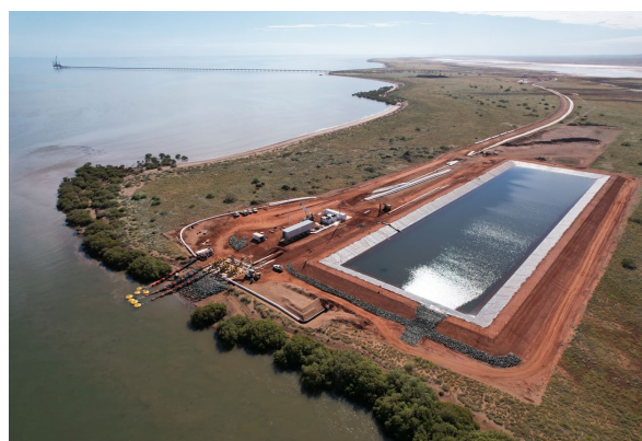
Figure 6: Secondary seawater intake station