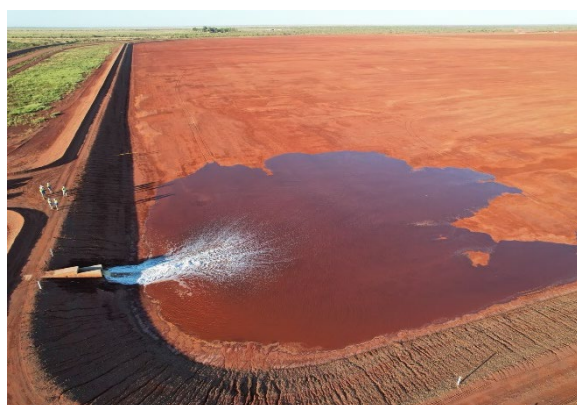
Figure 2: Commissioning Crystallisers (15 April 2025)