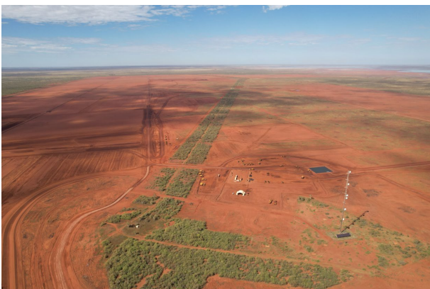
Figure 3: Crystalliser works

BCI remains committed to delivering Sulphate of Potash (SOP) as a byproduct and continues to progress FEED studies for this portion of the project. During the quarter, the Company awarded a contract to manage the engineering and design of its SOP pilot plant to eXcellerate Pty Ltd . With their technical expertise alongside Bluestar Lehigh Engineering Institute Co., Ltd. , BCI will work to refine the process flow design for its future SOP facility at the Mardie Project.