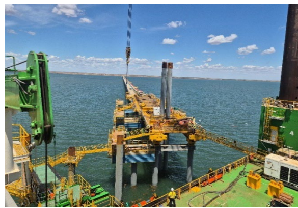
Figure 4: First jetty head piles installed