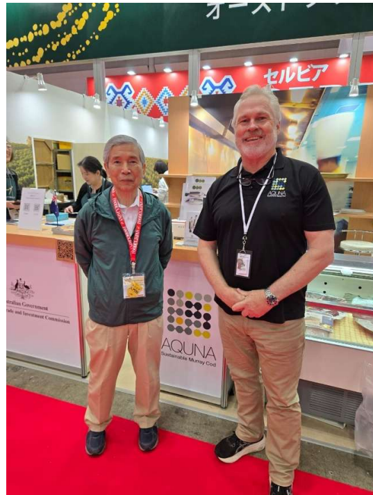
MCA Instagram: @aquasustainablemurraycod - Singapore & Japan Seafood Expos

Several discussions are now underway with potential channel partners, larger regional distributors and corporates in Southeast Asia.