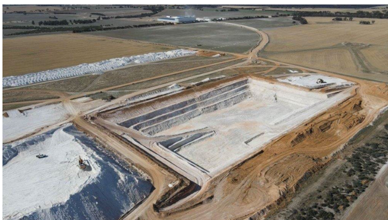
Figure 1 - Mining Operations at Wickepin