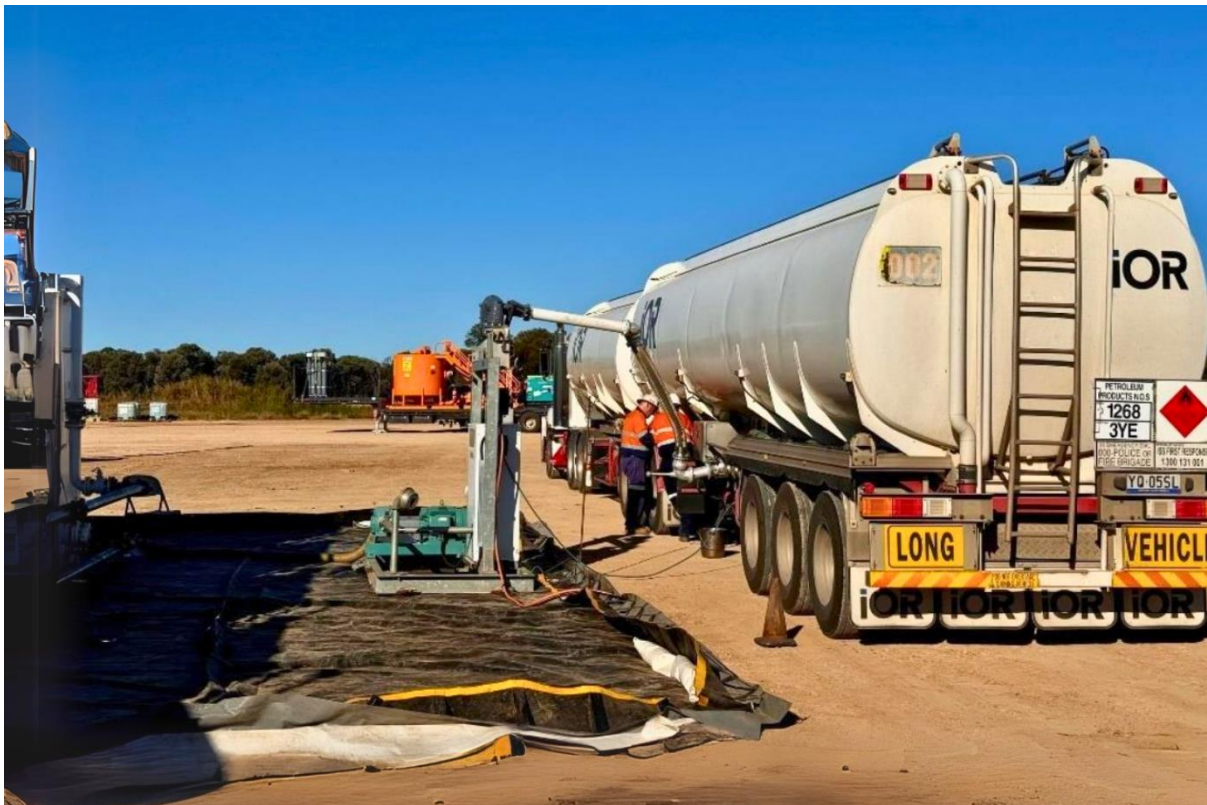
Figure 3: Tanker being loaded with oil from the Canyon-1H well for transport to refinery

Key milestones in 2H25 include an expanded well program, seismic acquisition and advancing strategic discussions with several potential Tier-1 international and domestic partners.