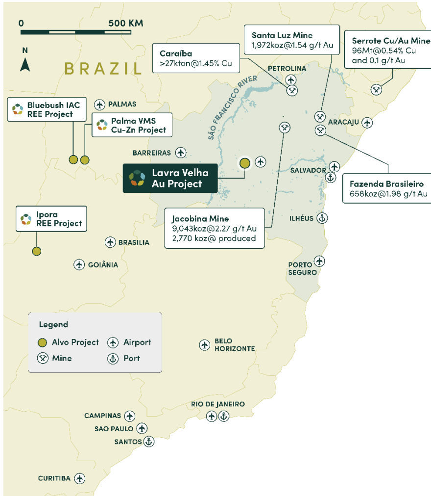
Figure 2: Lavra Velha Project location, Bahia state, Central-East Brazil. References for third party MREs are detailed on page 13 of this announcement.

The Lavra Velha Project is an advanced Gold, Copper and Silver IOCG-hosted project, located in the Sao Francisco craton, a prolific gold and copper producing region of central Brazil (See Figure 2).