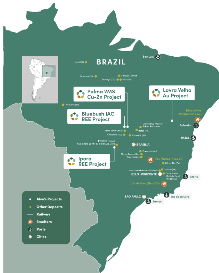
Figure 1: Alvo Minerals- Portfolio of Exploration Projects, Central Brazil.

More broadly, we have continued work at our flagship Palma Copper-Zinc Project, with auger drilling, soil sampling, geophysical surveys and geological mapping undertaken to progress our near-term prospective targets."