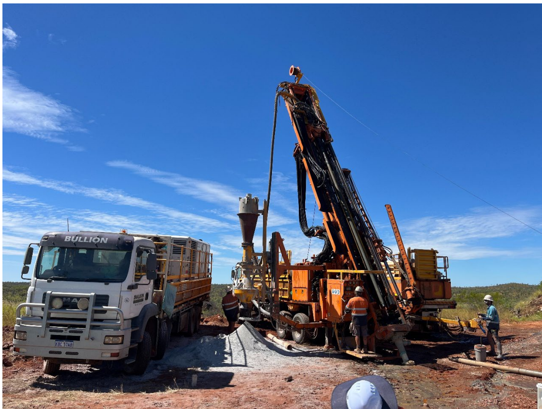
Figure 1: Active drill rig on the Surprise Copper Project.

When completed, this phase of drilling will have tested targets up to 1.2 km north of the Surprise Copper Mine. The Company intends to test several additional targets both north and south of the mine in a third phase of drilling later in the season once access is available.