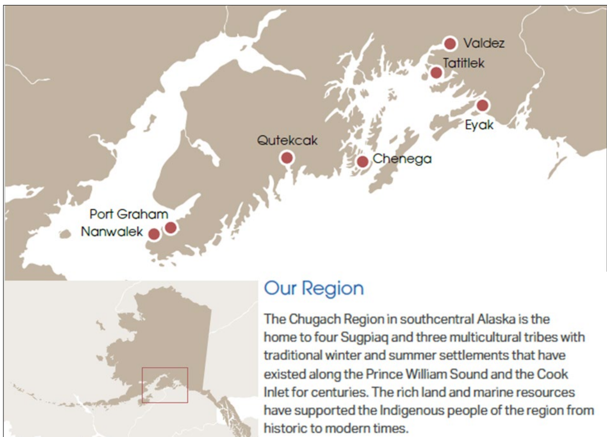
Chugach Region of Alaska

As a technology provider, Carnegie is well placed to work alongside local experts at Chugachmiut to investigate opportunities for future CETO wave energy projects. This MOU formalises ongoing discussions and demonstrates the parties’ commitment to active collaboration towards the deployment of wave energy in the region.