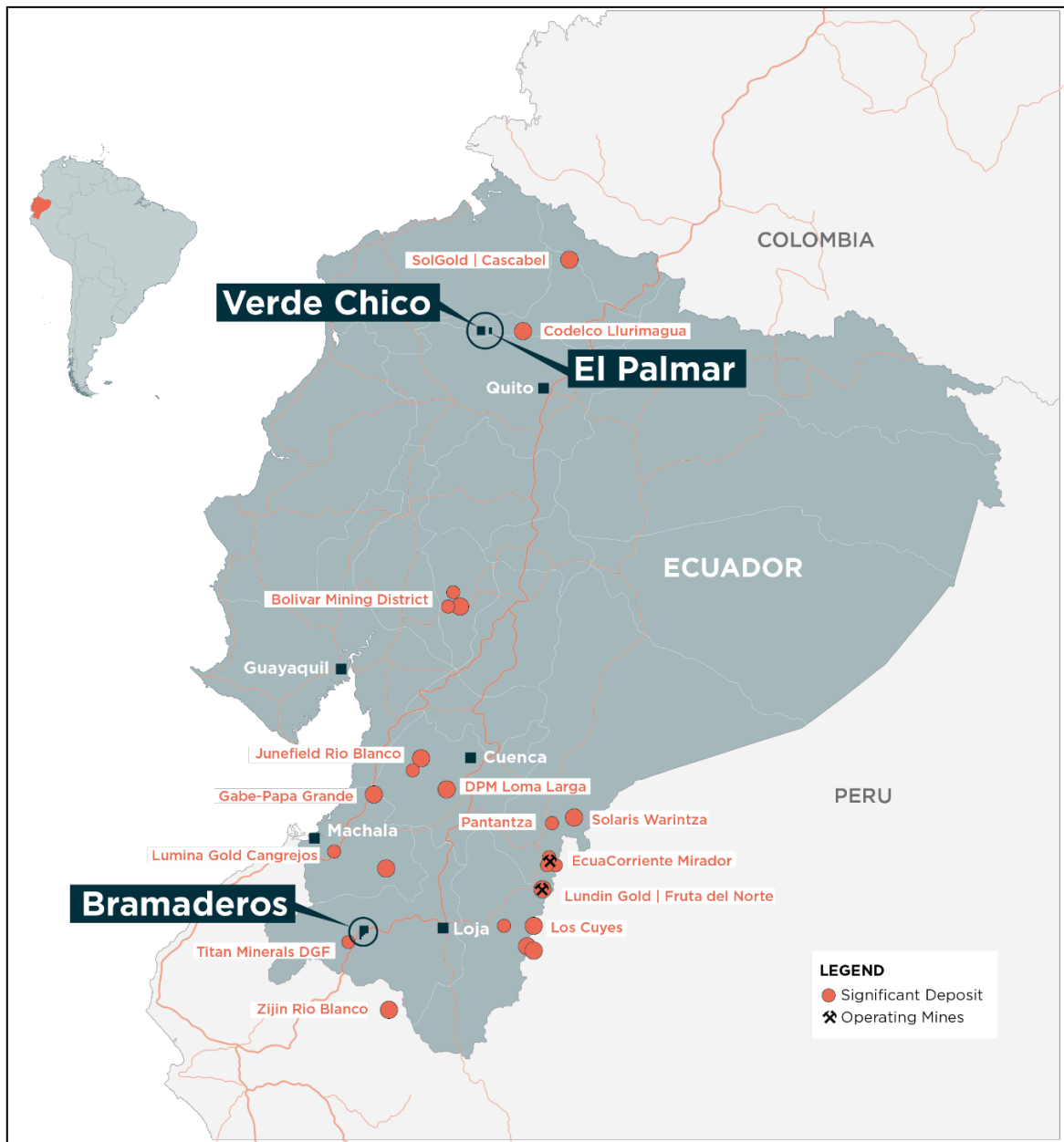
Figure 3: Location of Sunstone’s Bramaderos and El Palmar projects, Ecuador.