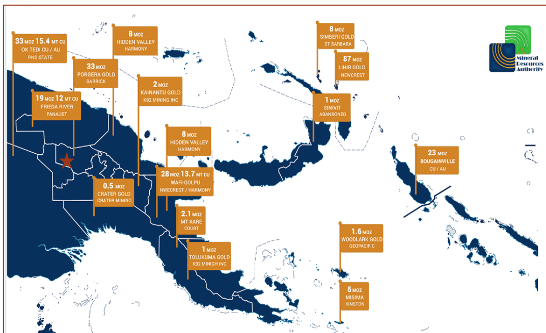
Figure 1: Mt Kare Location Map (Mt Kare Gold Project represented by a red star).

The Mt Kare Project is an exploration project discovered in 1987 by Conzinc Riotinto of Australia located in Papua New Guinea and is prospective for gold and silver. The Mt Kare Project has had prior expenditure of approximately A$75 million. The Project lies 15 kilometres southwest of Barrick (Niugini) Limited's 31-million-ounce Porgera gold mine 1 , which has historically produced over 500,000 ounces of gold per year.