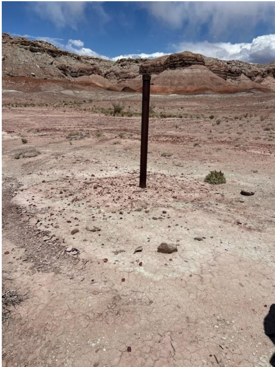
Figure 2: Photo of the Mt Fuel-Skyline Geyser drill pad showing minor work necessary to re-establish the drill pad.

The fractured rock of these units forms an excellent reservoir for supersaturated brines. Due to the presence of the above attributes, when brine is removed at an extraction point it may flow into the voids from where it was removed. This would assist in maintaining high reservoir pressure and help deliver a high ultimate recovery of brine.