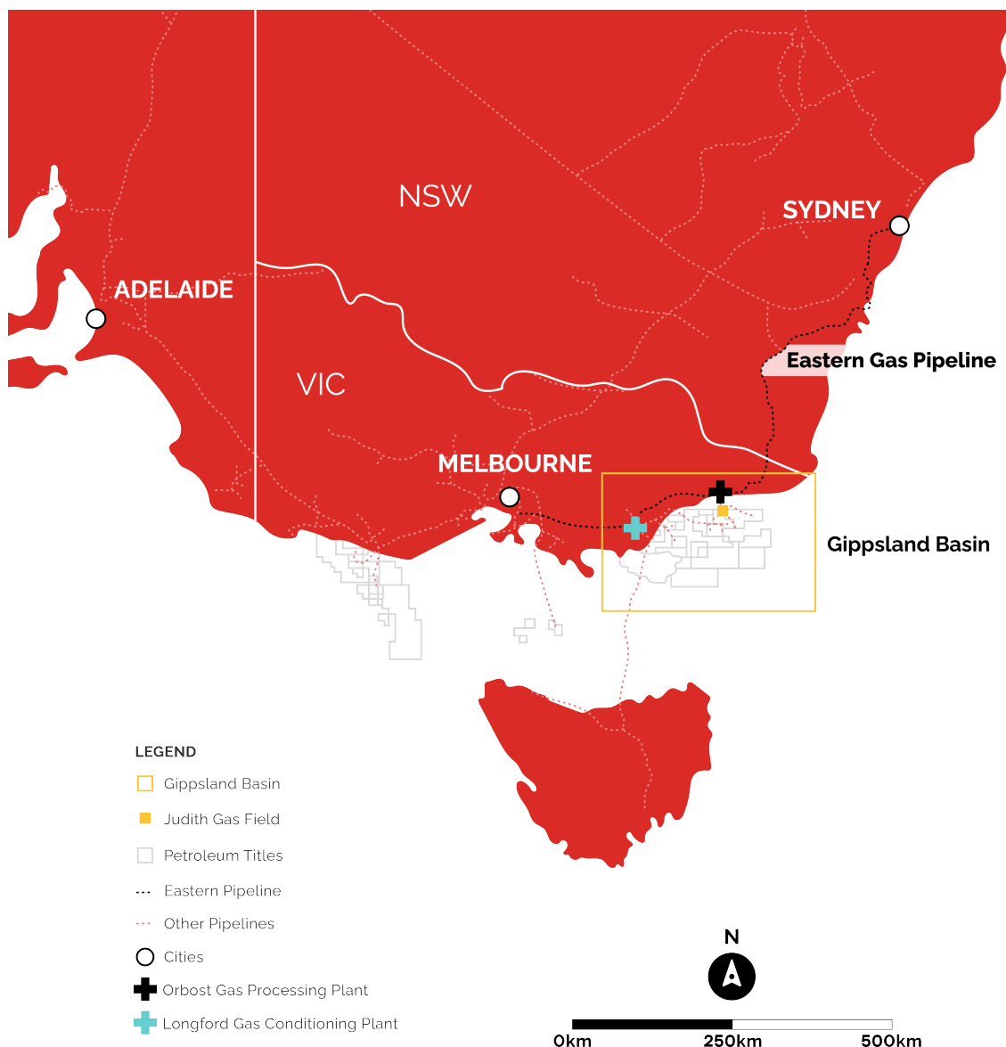
Figure 1: Gippsland Basin, Bass Strait