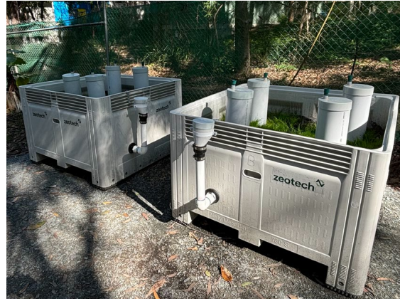
(above) simulated landfill configurations located at Griffith University

Two configurations contained the Company's zeoteCH 4 ® products, which showed constant high oxidation rates in Activities A & B. The zeolite-based products are manufactured from the Company's Toondoon kaolin mineral and a coal combustion by-product from a southeast Queensland generator, utilising proprietary processing technology developed in-house by the Company.