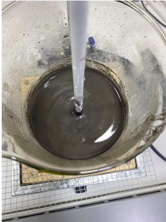
Images 4 and 5 Acid leaching process

Taza Metal Technologies , a Kazakhstan-based manganese mining and chemical processing company, is seeking to utilize stockpiles of lower-grade manganese ore (18–20% Mn) for high-purity manganese sulfate (HPMSM) production.