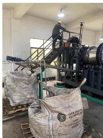
Images 1,2 and 3: Calcining kiln, high temperature observation portal, roast feed and discharging