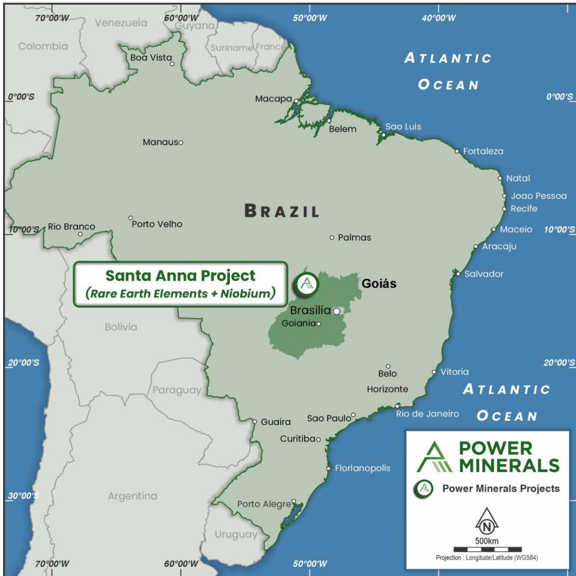
Figure 2. Santa Anna Project location map in Goiás State, central Brazil.

Given these uncertainties, no one should place undue reliance on any forward-looking statements attributable to the Company, or any of its affiliates or persons acting on its behalf. Subject to any continuing obligations under applicable law, the Company disclaims any obligation or undertaking to disseminate any updates or revisions to any forward-looking statements in this announcement to reflect any change in expectations in relation to any forward-looking statements or any change in events, conditions or circumstances on which any such statement is based.