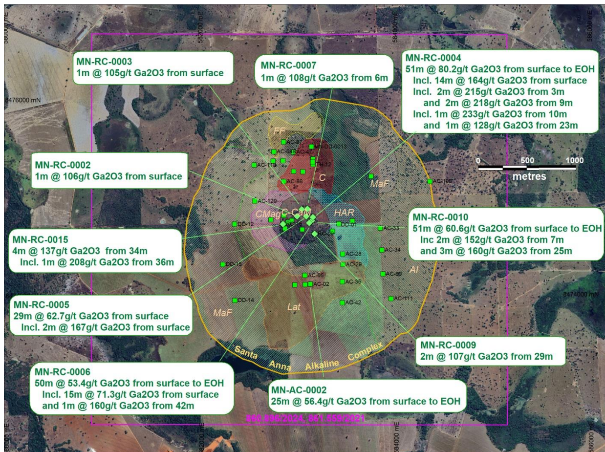
Figure 1. Santa Anna Project plan showing significant higher-grade gallium results from previous drilling. All drillholes containing at least one sample with 50g/t Ga 2 O 3 or greater is show as green dots.

During the due diligence at the Santa Anna Project, Power has identified multiple high-grade gallium intersections from historical drilling through further interrogation of available exploration data. These gallium results complement Power's previous identification of the Project's significant REE potential as announced in the ASX announcement 22 April 2025. The Project has a comprehensive drilling database containing detailed information on 192 drillholes covering 5,377 metres in total, 196 surface geochemical samples and extensive trenching data.