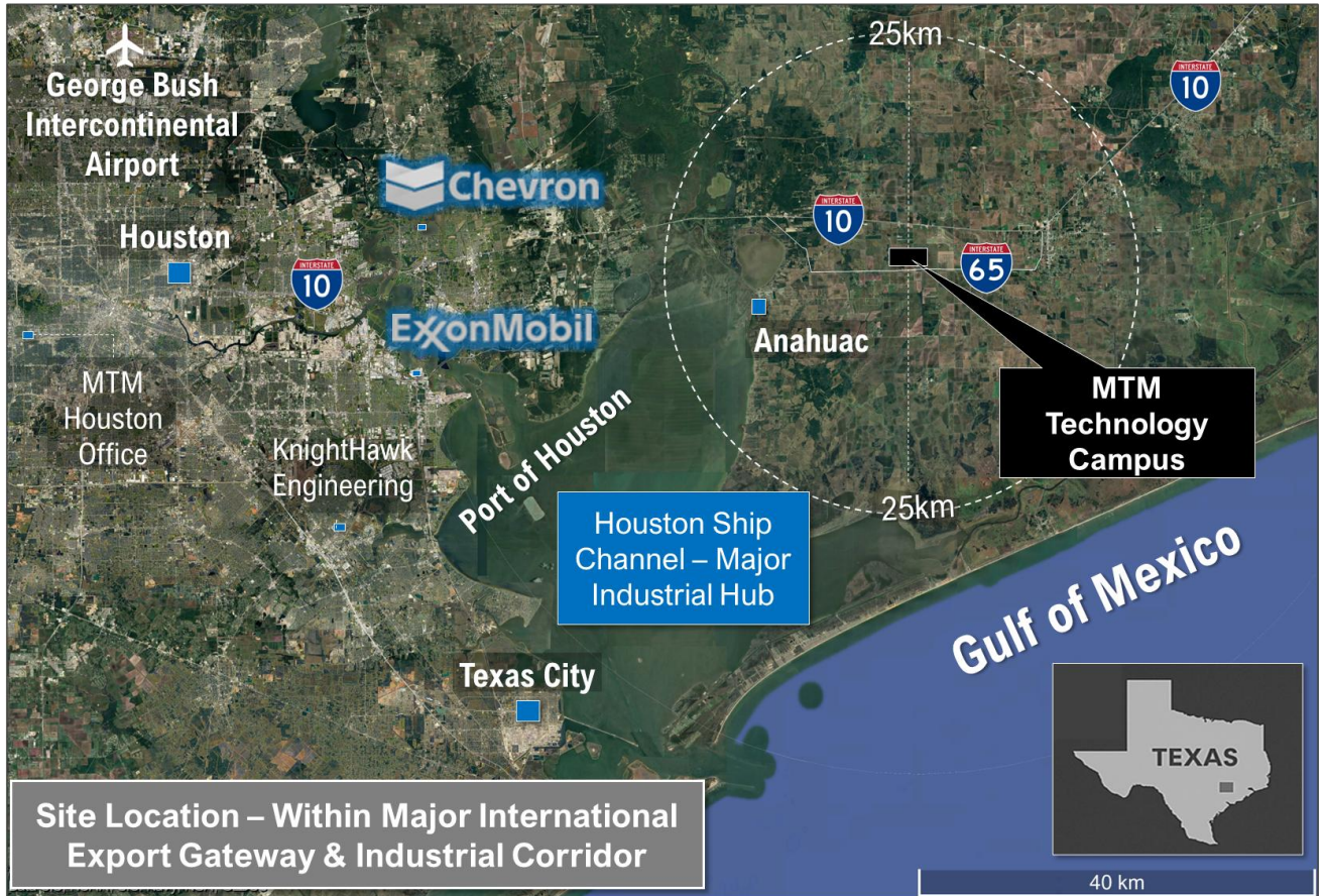
Figure 3: Map showing the site's strategic location in Texas – situated east of Houston in the heavy industrial Gulf Coast corridor with easy highway and port access.