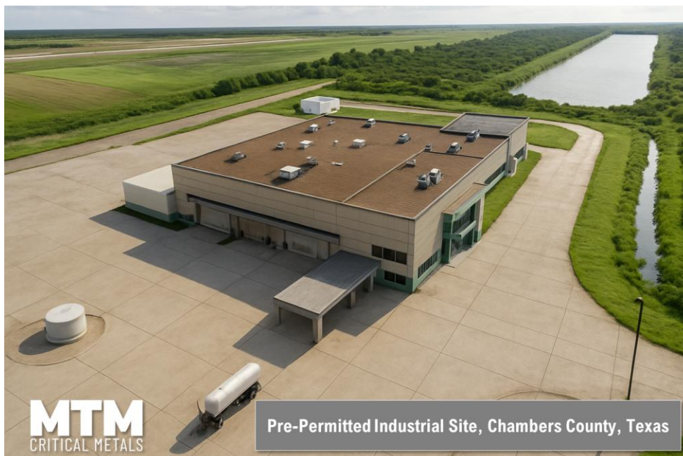
Figure 1: Newly secured Chambers County site, featuring existing industrial facilities and infrastructure

The site is located within one of Texas' most established heavy industrial corridors and is surrounded by legacy waste processing operations. Its proximity to Interstate 10 and the Houston Ship Channel provides efficient access to global logistics, industrial suppliers, and downstream customers. The property is pre-permitted for industrial waste handling and processing, and includes extensive existing infrastructure such as sealed access roads, onsite power, wastewater management, security fencing, and office/warehouse facilities. The location also offers access to low-cost industrial electricity and proximity to the Houston region's skilled industrial workforce.