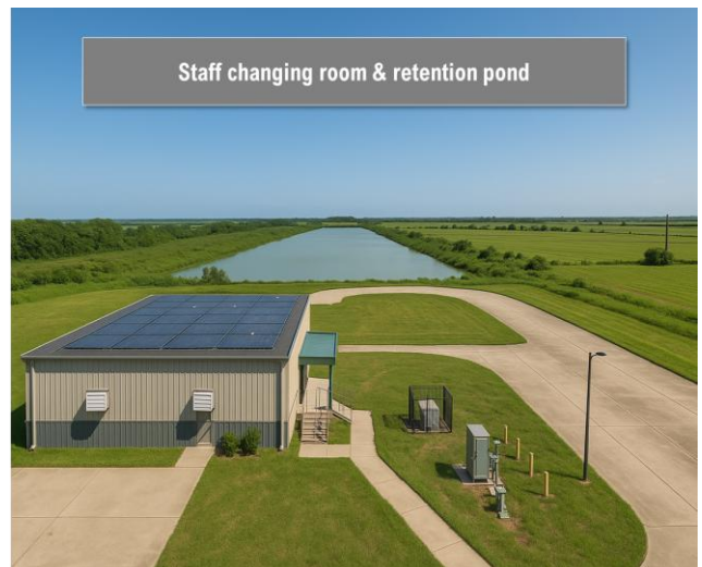
Figure 2: Additional views of the Texas site highlighting on-site infrastructure, including buildings and sealed road access.