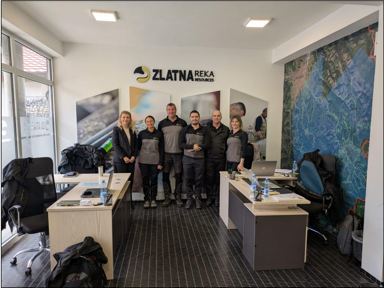
Figure 2. Photo of the community relations team at the recently opened Novi Pazar office.