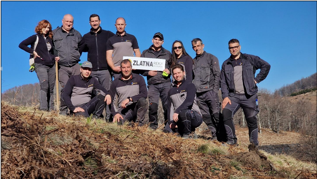
Figure 3. Photo of Zlatna Reka team during the tree-planting at Rogozna.