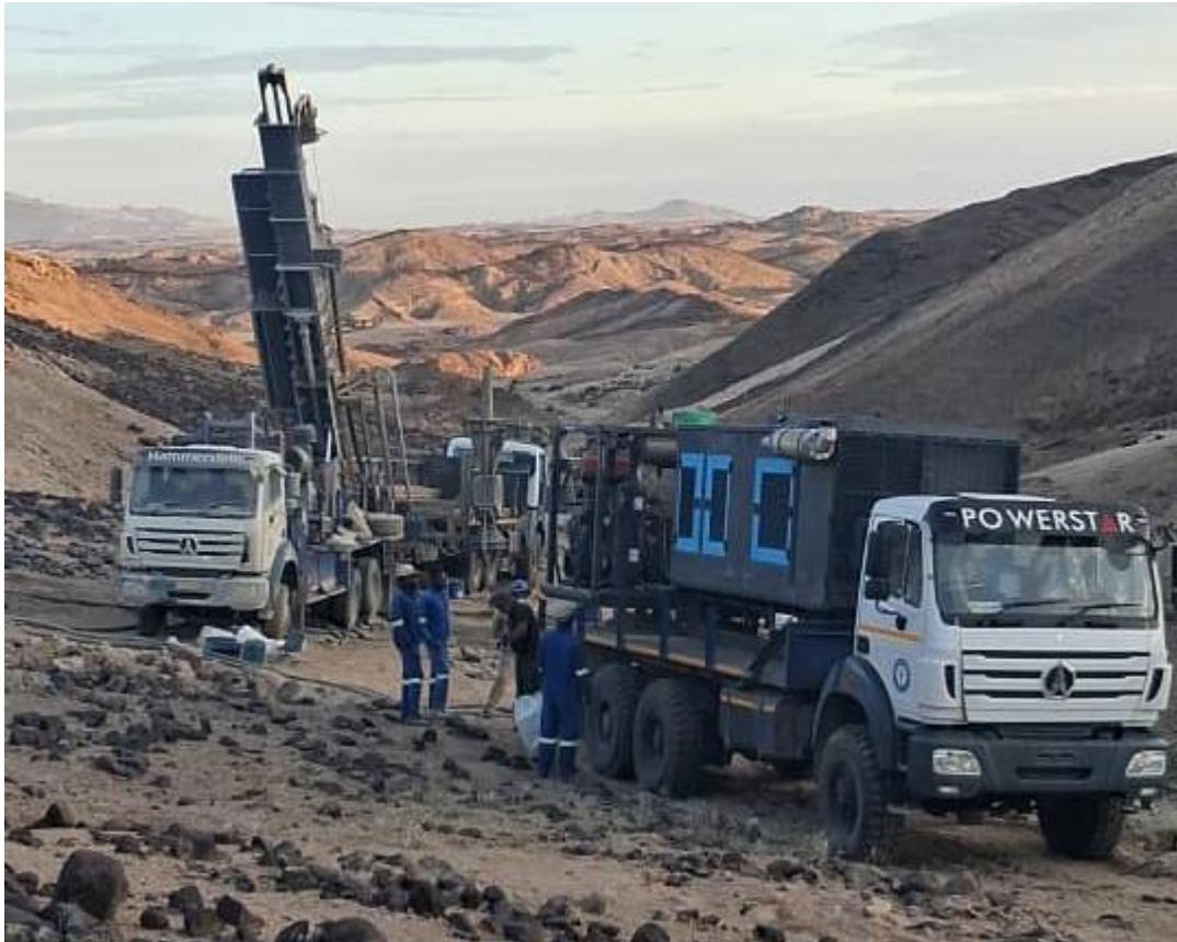
Figure 1. RC drilling activities at the Etango North-East Project