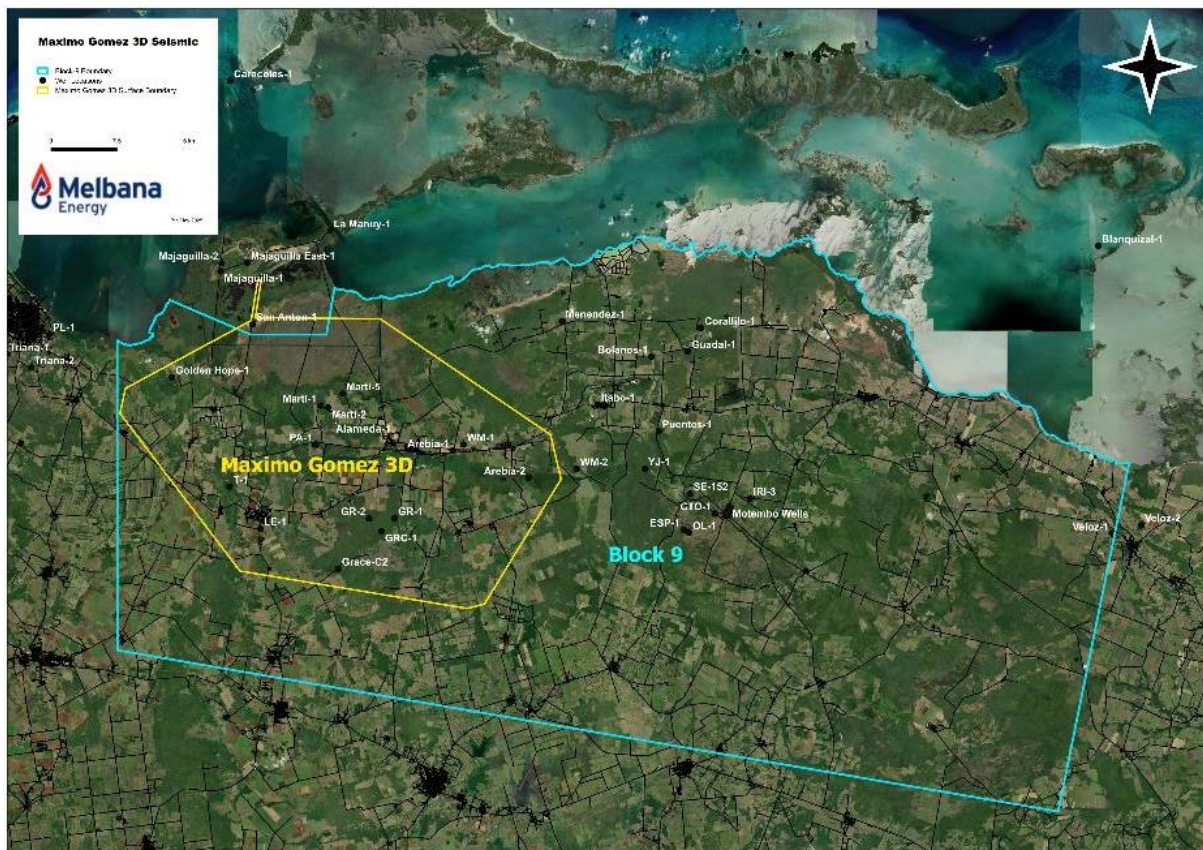
Figure 6 - Location of the proposed Maximo Gomez 3D seismic survey

Proposals for the proposed 3D seismic survey have recently been received from four international companies. Following a period of evaluation, a preferred tenderer is expected to be nominated based on a combination of qualification factors including cost, technical and operational capabilities. The proposal included four potential survey designs to address the challenge to image subsurface targets ranging from 200 metres below surface to greater than 4000 metres. The survey would require the seismic waves to be generated using vibrators as well as dynamite. In addition to providing vital information required for the efficient development of the Alameda and Amistad Fields, the survey area also include the highly prospective