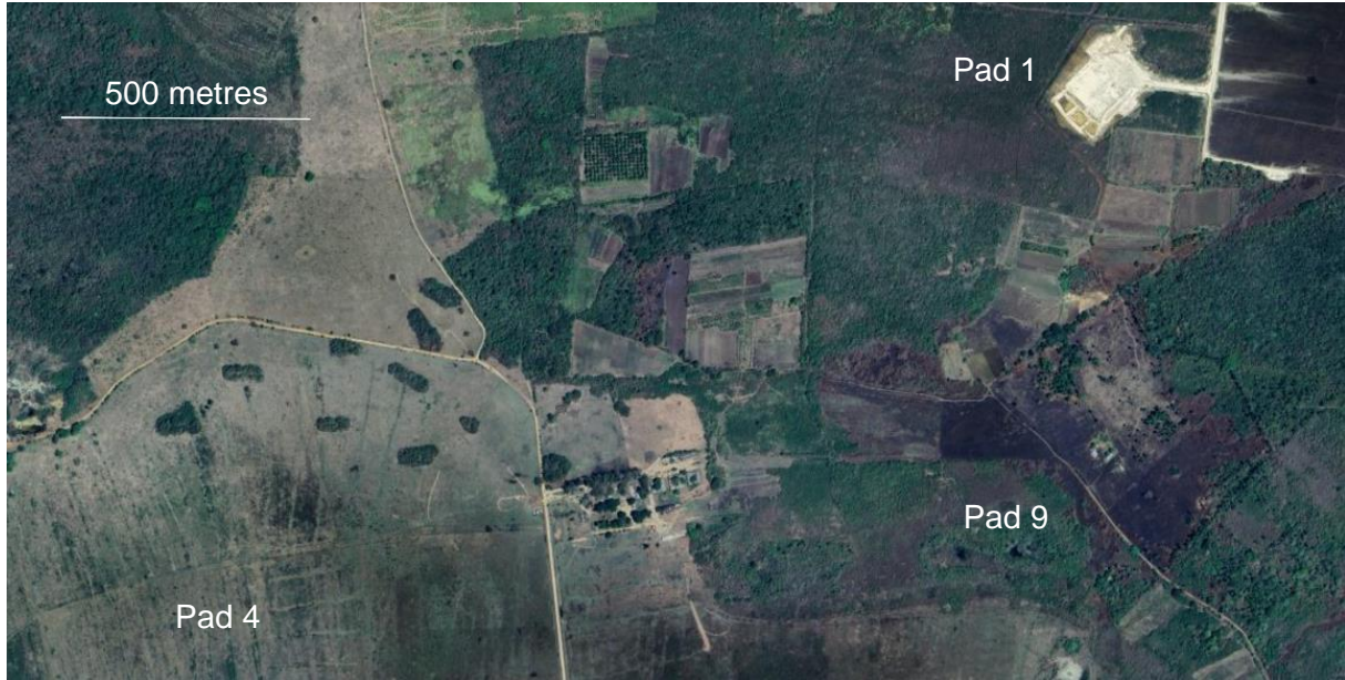
Figure 3 – Location of new pads for upcoming production wells