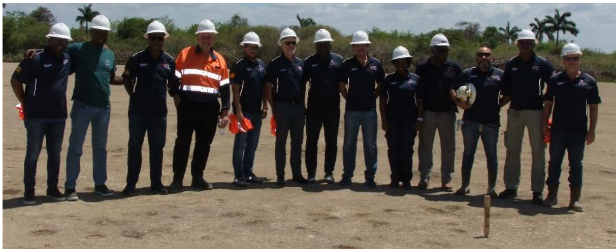
Figure 2 - Inspection of pad and position of upcoming Amistad-2 production well - April 2025

Construction of Pad 9 and access roads for the drilling of Amistad-2, located approximately 850 metres to the southwest of Alameda-2 on Pad 1 (see Figure 3), are complete and all material permits required to commence drilling have been received. The well is to be a dedicated Unit 1B oil producer and its design has been significantly simplified by incorporating lessons learned from previous wells. Drilling to total depth is expected to take less than three weeks, with completion and testing to follow.