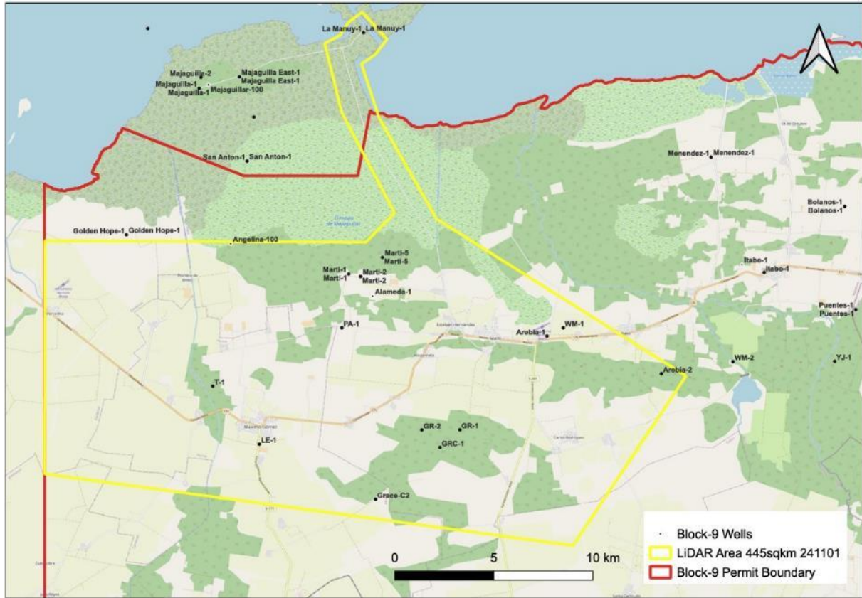
Figure 7 - Location of the LiDAR survey conducted in 1Q 2025

Máximo Gómez and Grace leads which are presently poorly defined by existing 2D seismic data. The objective is to commence permitting for the survey as soon as the preferred tenderer is chosen, with acquisition anticipated to commence in Cuba's next dry season (November 2025 to April 2026).