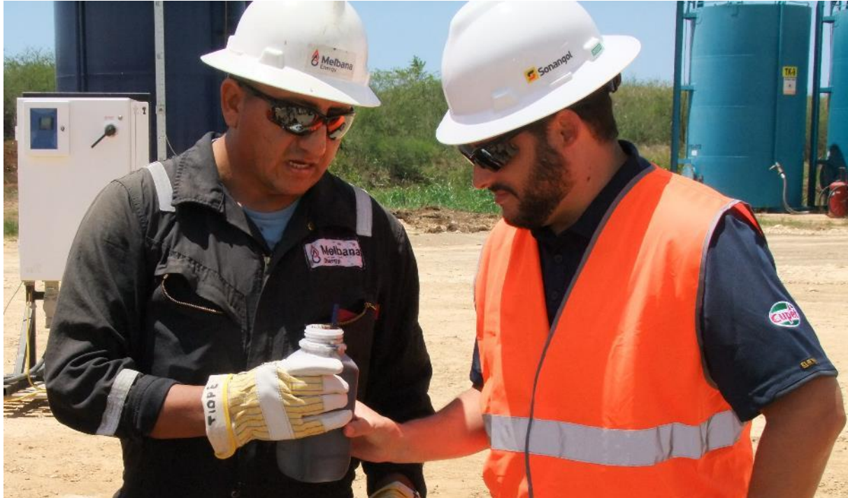
Figure 1 - Inspecting a sample of crude oil production from Alameda-2

With more than 15,000 barrels of oil now in storage, the first shipment could take place towards the end of next month. The intended buyer of the oil is currently conducting investigations into the timing and availability of either a suitable coastal tanker or pooling the cargo with scheduled upcoming exports of larger volumes of crude oil.