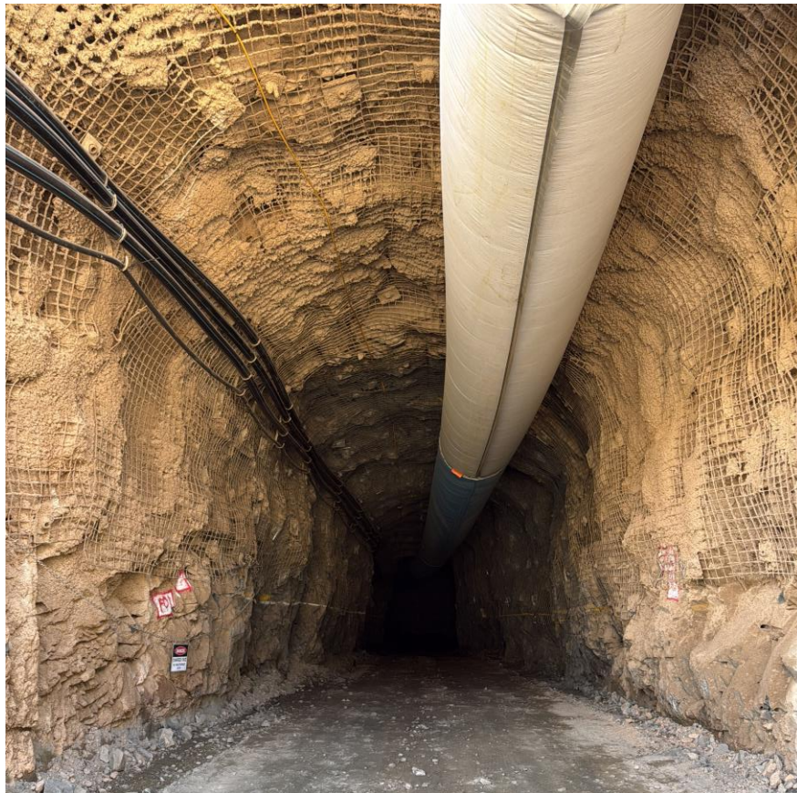
Figure 2 - Fish underground decline with ventilation and power installed