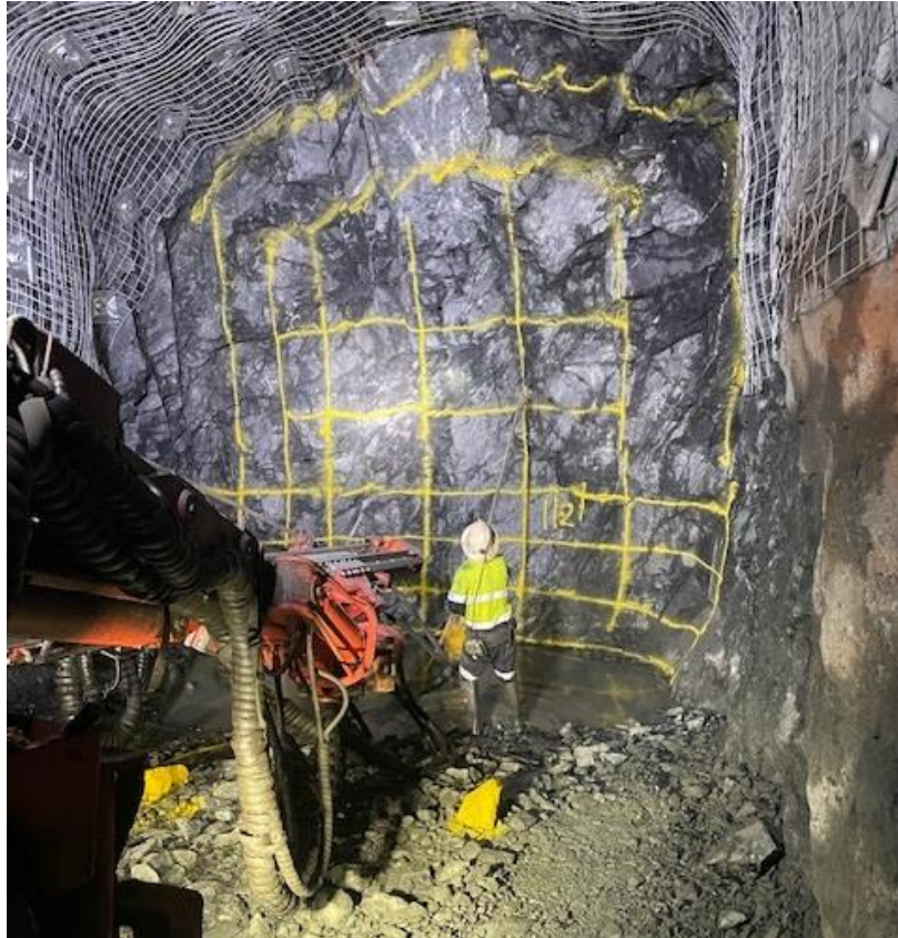
Figure 3 – Decline being marked up at Fish