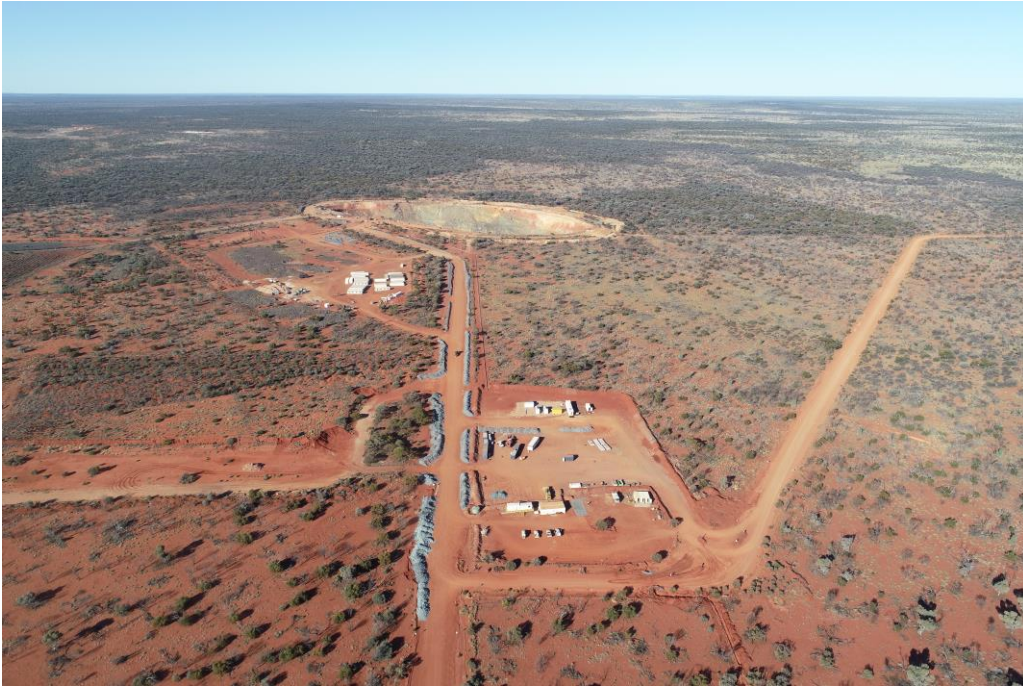
Figure 1 - Technical Services Office (foreground) and Fish Mine (background)