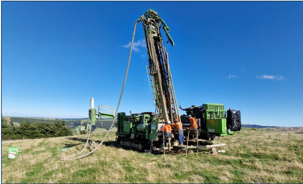
Figure 2: Photo of RC drilling operation on Waipori Station