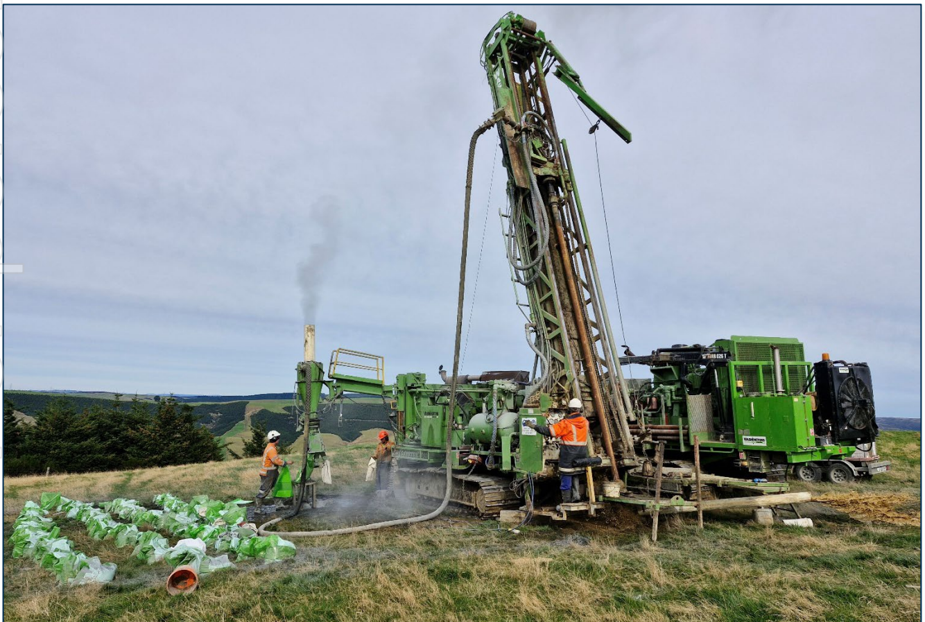
Figure 3: Photo of RC drilling operation on Waipori Station