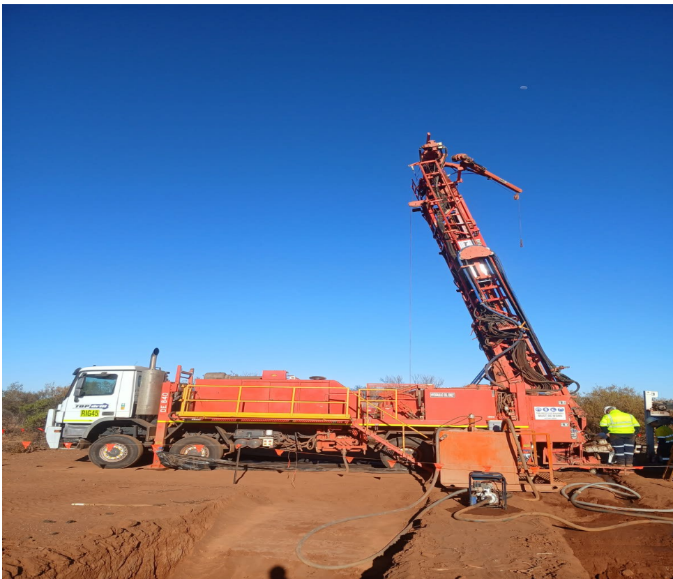
Figure 1: Drilling in operation at Mt Clere

"The company and our external consultants are extremely excited to have commenced the drilling of this massive anomaly, which BHP fell short of testing nearly 30 years ago. We eagerly await the results from this campaign and will update shareholders accordingly"