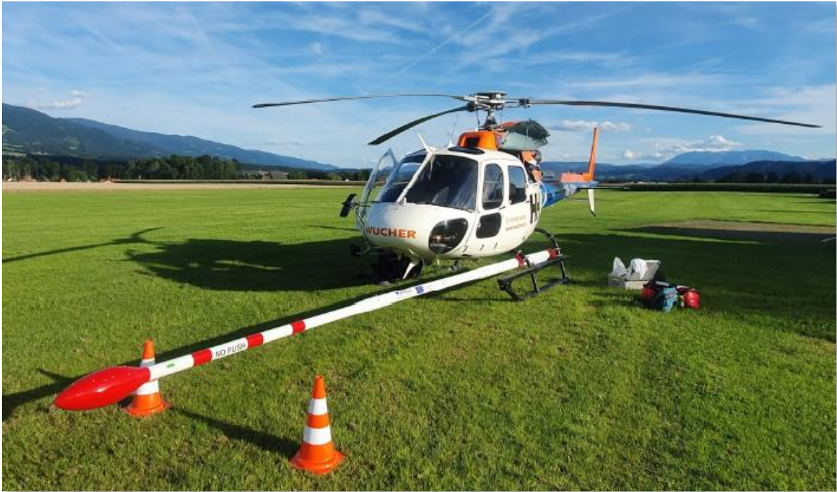
Figure 2: Nose boom magnetic and radiometric configuration on helicopter.