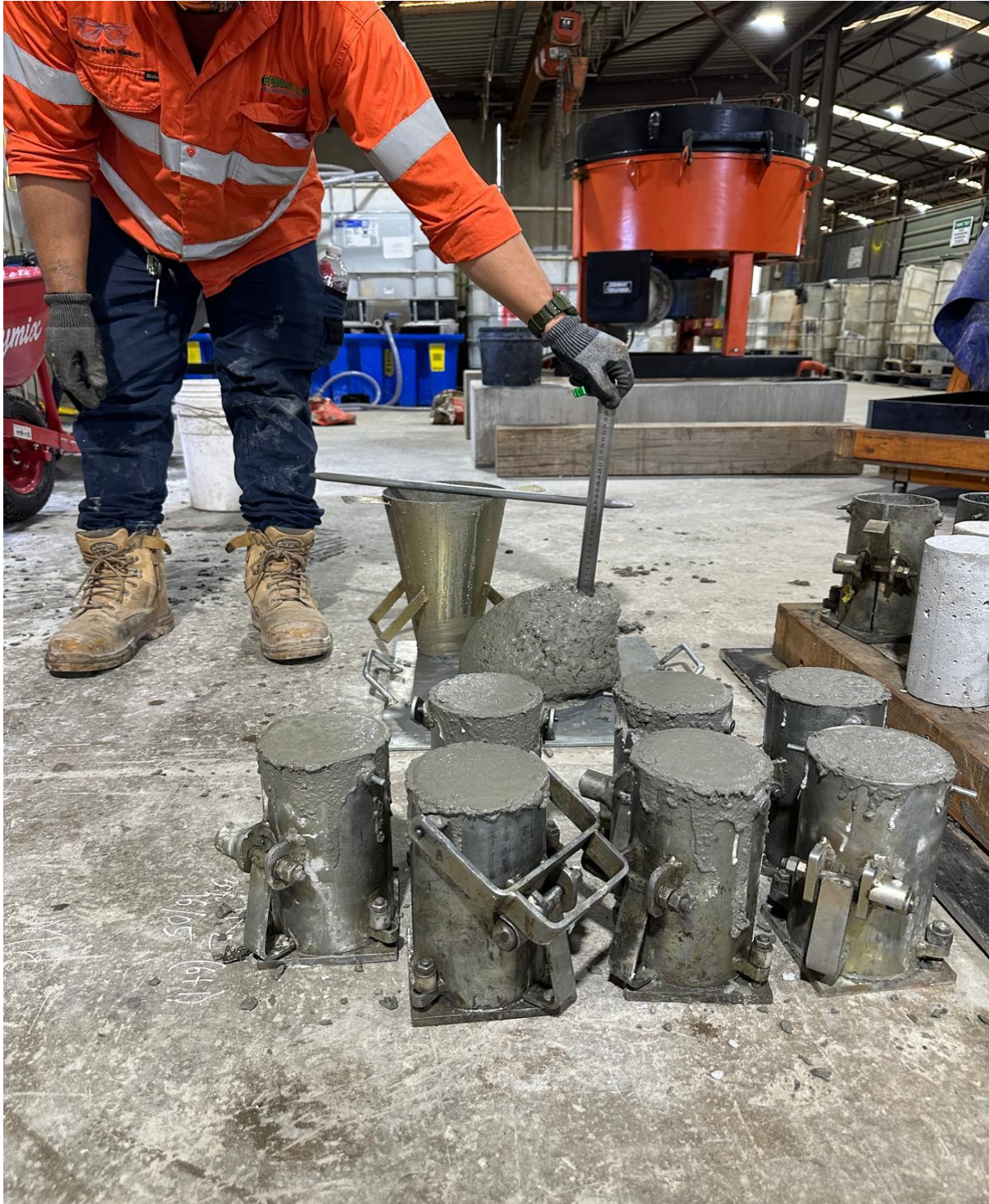
Photo: slump retention testing and comprehensive strength cylinders conducted on 20%, 30% and 40% Portland cement replacement with metakaolin