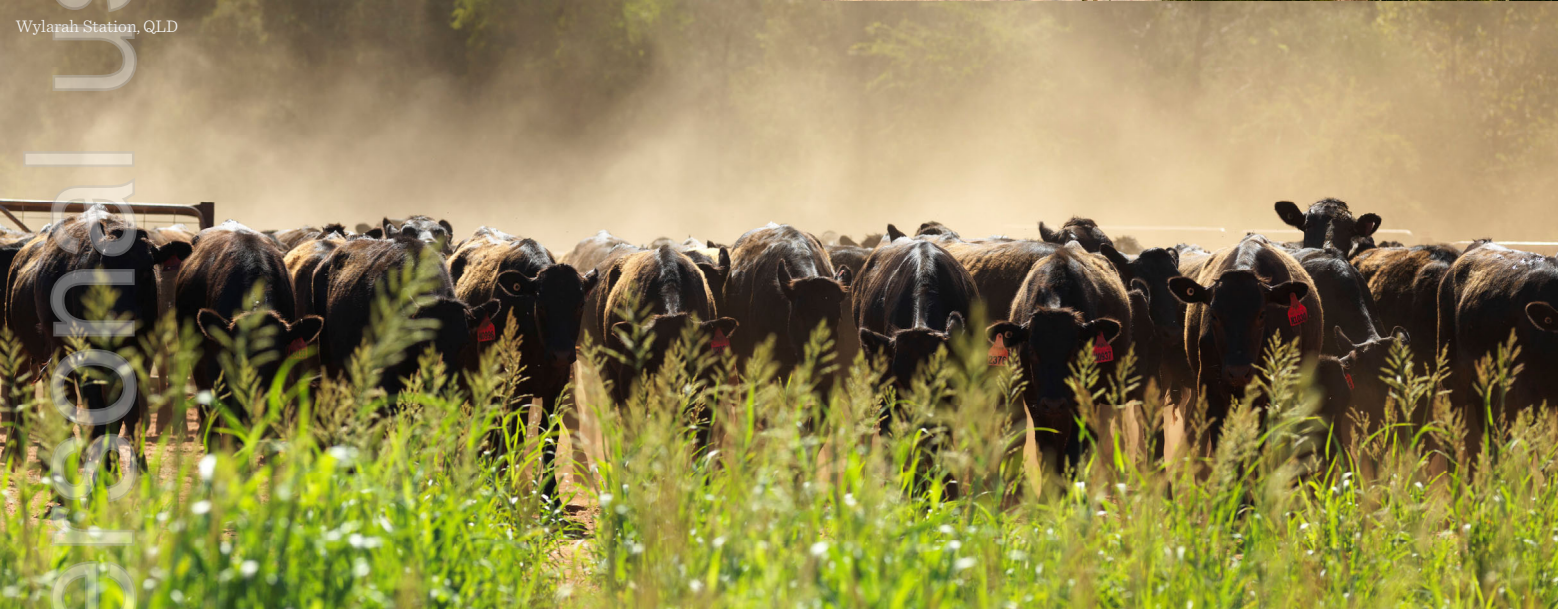
Wylarah Station, QLD