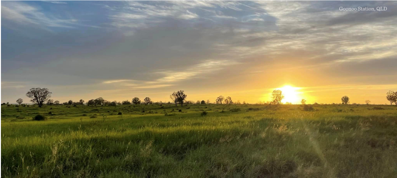
Goonoo Station, QLD