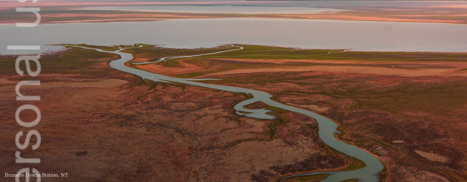
Brunette Downs Station, NT