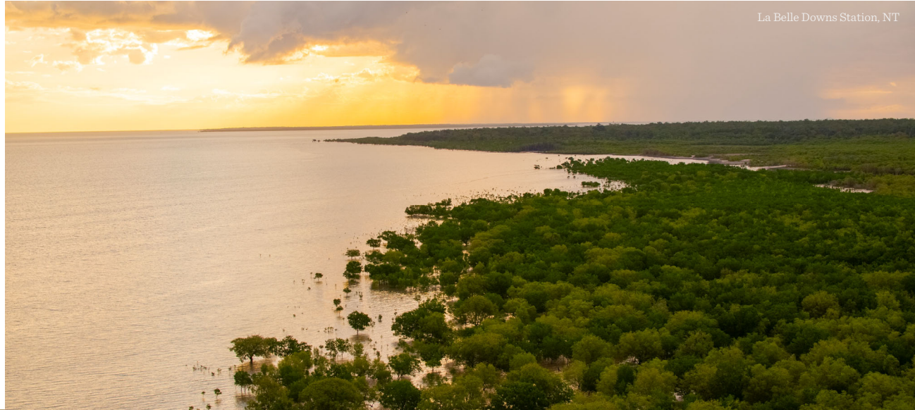
La Belle Downs Station, NT