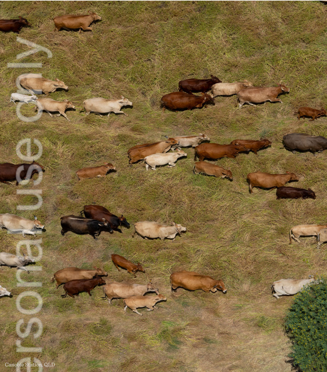
Canobie Station, QLD