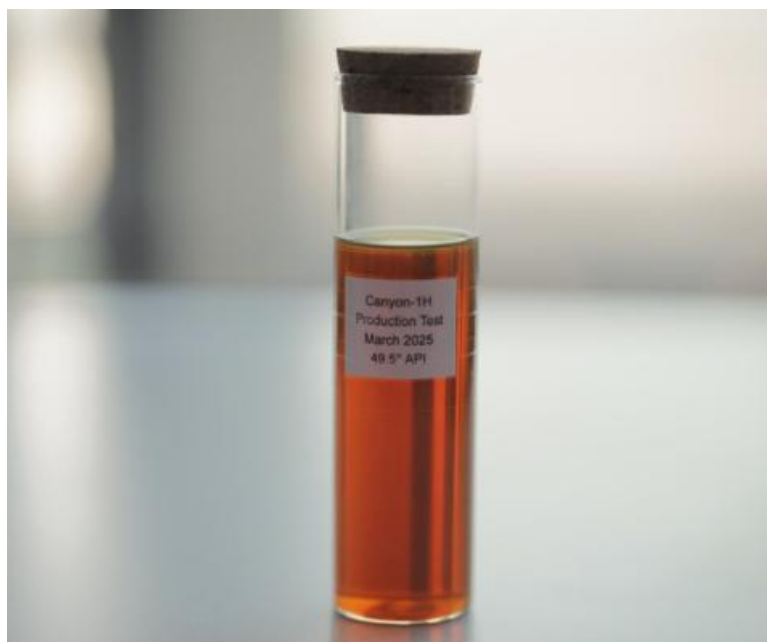
Figure 5 – Crude oil sample from Canyon-1H flow test