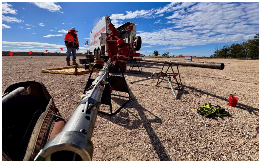
Figure 1 – Loading casing perforation guns in preparation for pumping the first DFIT on Canyon-2

Omega's Canyon Project continues to show extremely positive results. The Canyon-2 cased hole logs have provided confirmation of an extensive oil and gas province with encouraging signs pointing toward commerciality. The Canyon-2 DFIT program will add to our understanding of stacked pay potential and allow important regional correlations – further de-risking the play. Omega's cash position is strong and encouraging discussions are ongoing with potential future partners.