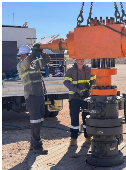
Figure 4 – Preparing for DFIT testing at Canyon-2

The Canyon-2 DFIT test program commences today with a series of tests to be performed over coming months in selected zones throughout the prospective Permian interval. The DFIT program will gather diagnostic geomechanical data and measure the level of overpressure in multiple zones. This will allow characterisation of overpressure changes with depth and inform zonal correlations across the project area – an important de-risking of the play.