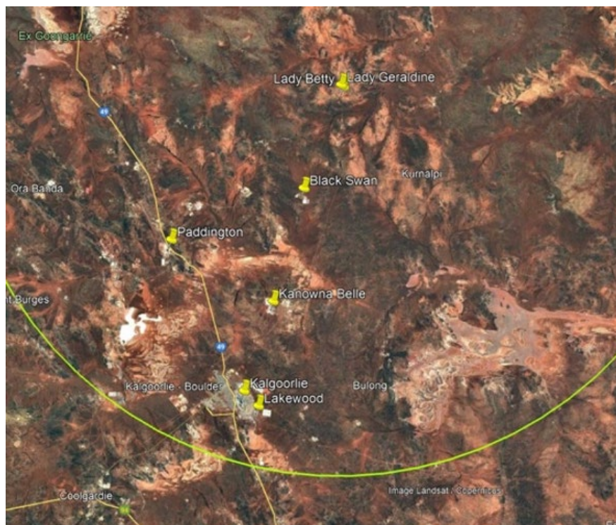
Figure 2. Whiteheads' Gold Project proximity to operating mines and processing infrastructure

Located just 80km north-east of Kalgoorlie, the Whiteheads Project benefits from excellent access via sealed and well-maintained unsealed roads, well-established infrastructure and proximity to operating mines, including Northern Star Resources Ltd (ASX:NST) Kanowna Belle mine, which is 40km south of Whiteheads. In F24 Kanowna Belle gold production was 166Koz. The Kanowna Belle process plant has capacity of approx. 2Mtpa. The project location also offers potential access to significant nearby third-party processing capacity (~9.2Mtpa), which could provide future pathways for toll treatment options (Figure 2).