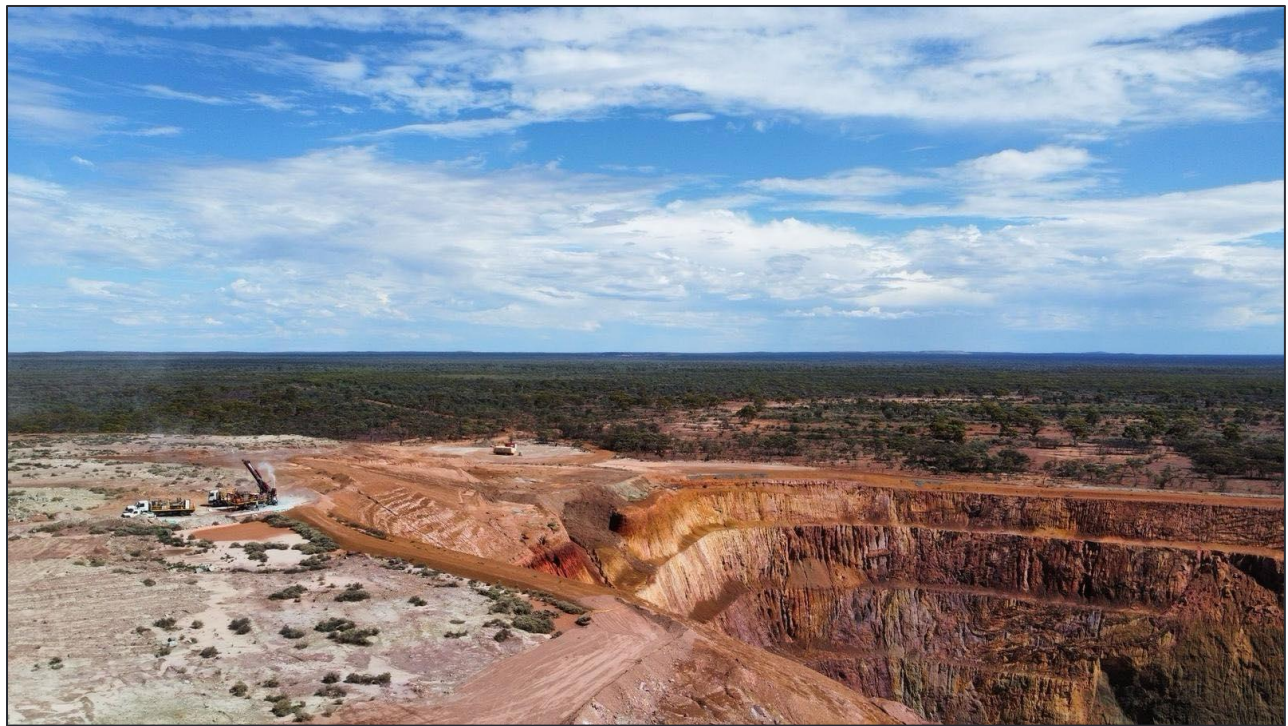
Figure 3 – Drill Rig at the Eureka Gold Project

This ASX announcement has been authorised for release by the Board of Javelin Minerals Limited.