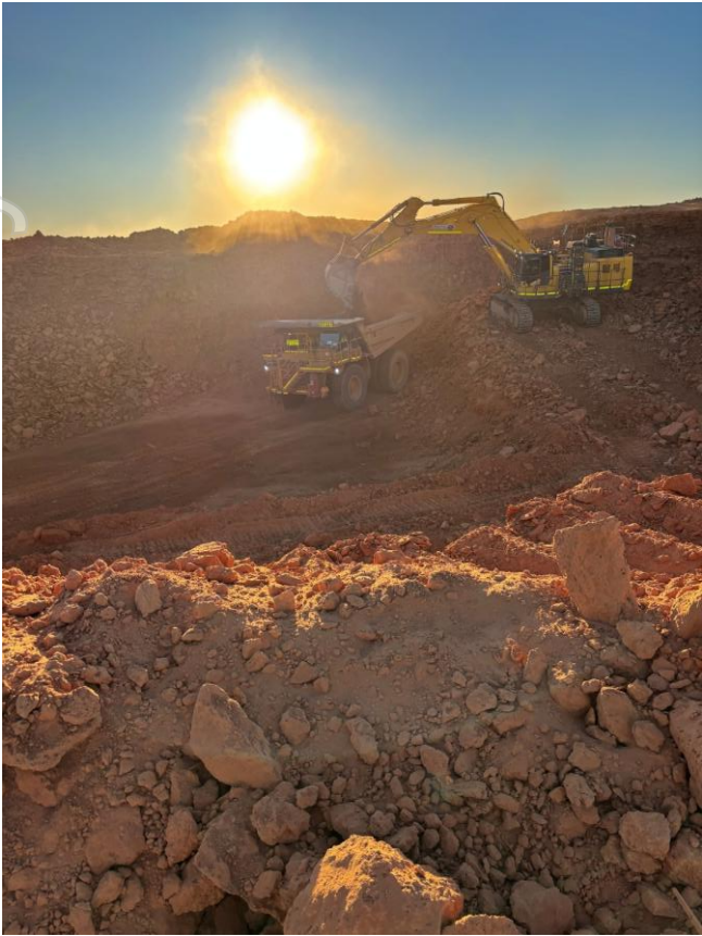
Figure 7: 120t excavator operating at Turnberry Central Stage 1 open pit, May 2025.