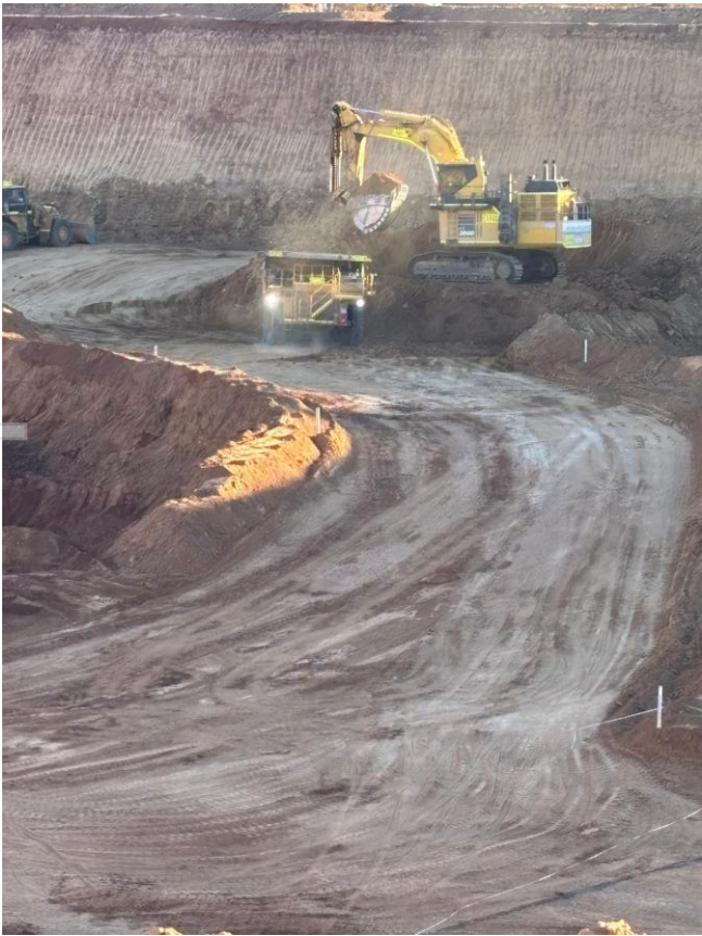
Figure 8: 200t excavator operating at St Anne's North Stage 1 open pit, May 2025.