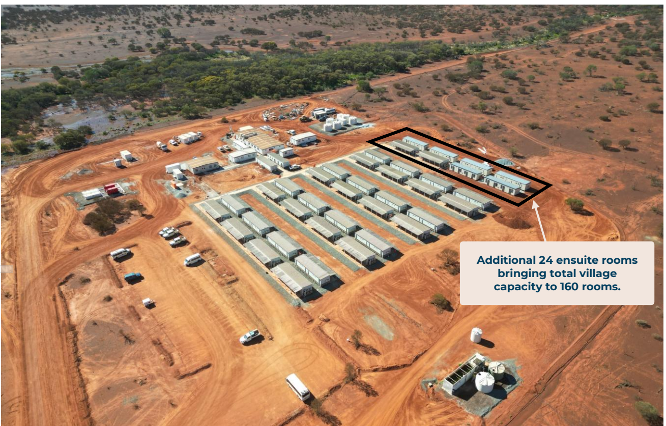
Figure 4: Accommodation village expansion to 160 rooms was completed to support an expanded open pit and underground mining workforce, May 2025.