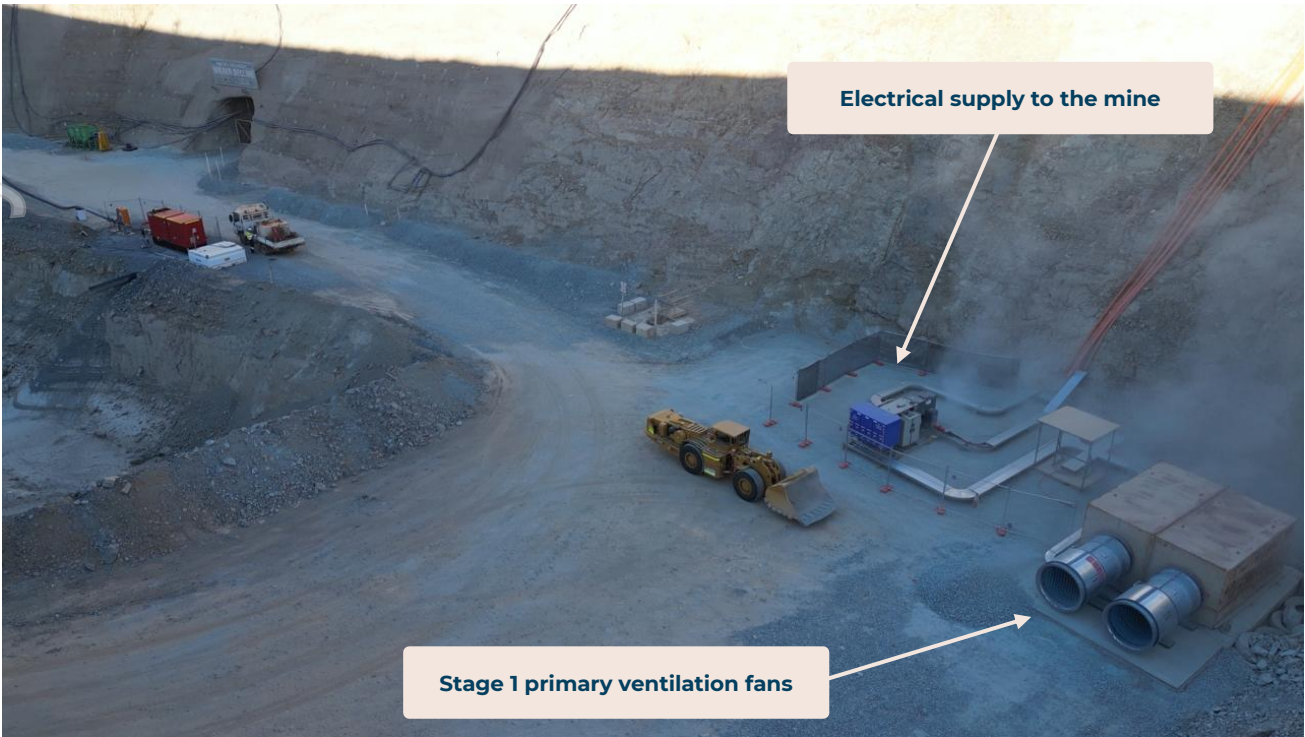
Figure 5: Power and mine services established to the Andy Well underground. Stage 1 primary ventilation also installed in advance of first ore development in mid-2025.