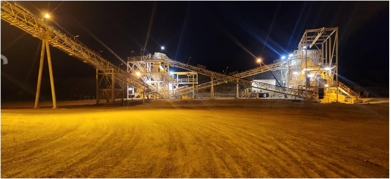
Figure 1: Process plant energised in advance of full commissioning in June 2025.