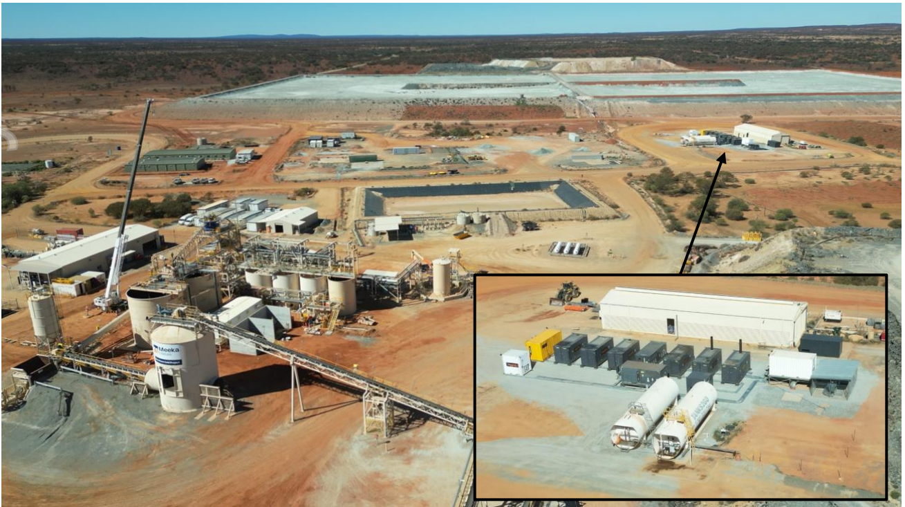
Figure 3: Power station upgrade completed, May 2025.