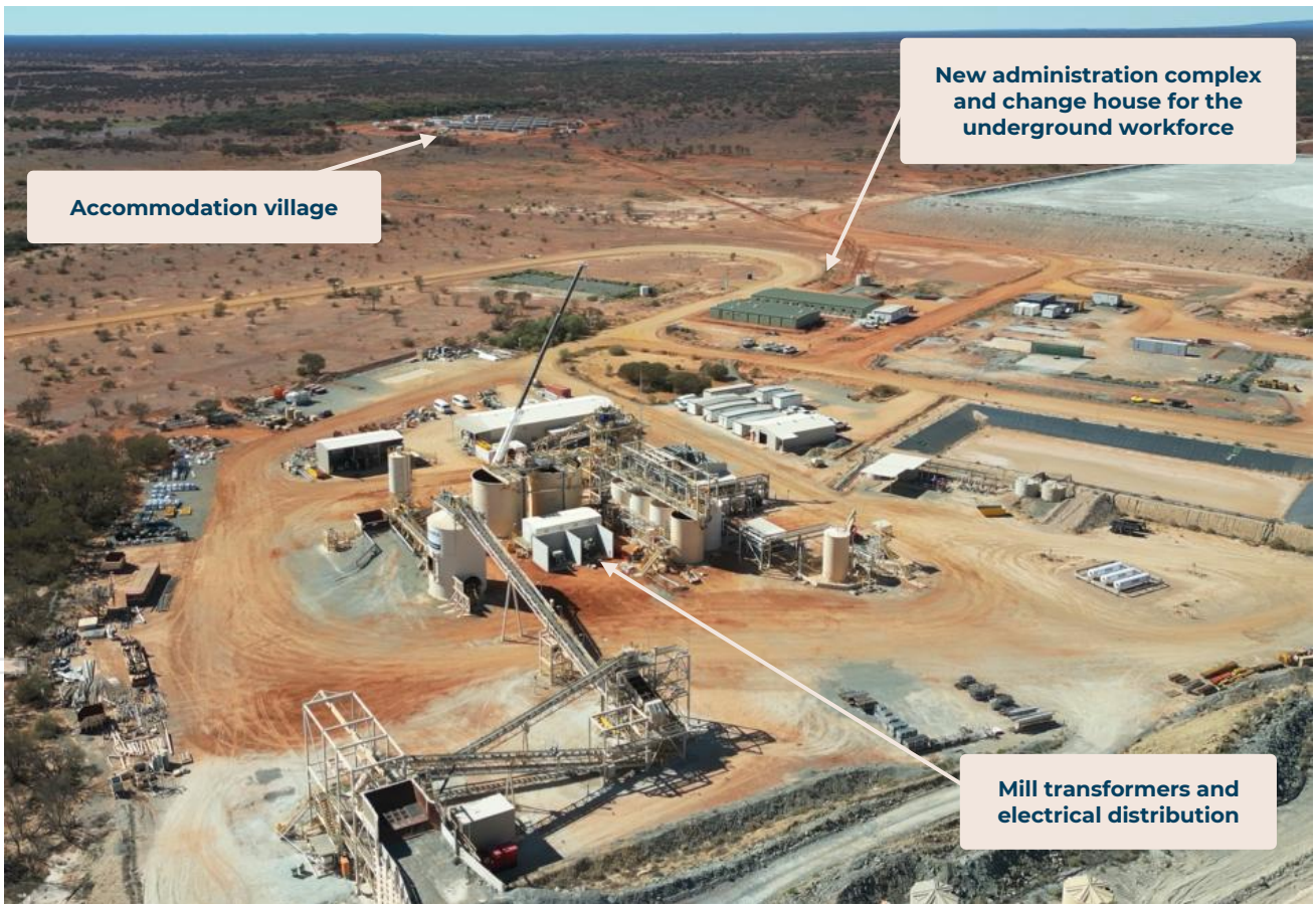
Figure 2: Installation of transformers and electrical distribution within the processing plant completed, administration complex and village in the background, May 2025.