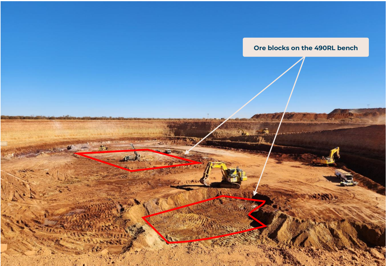
Figure 6: Progress at St Anne's North Stage 1 open pit, May 2025.