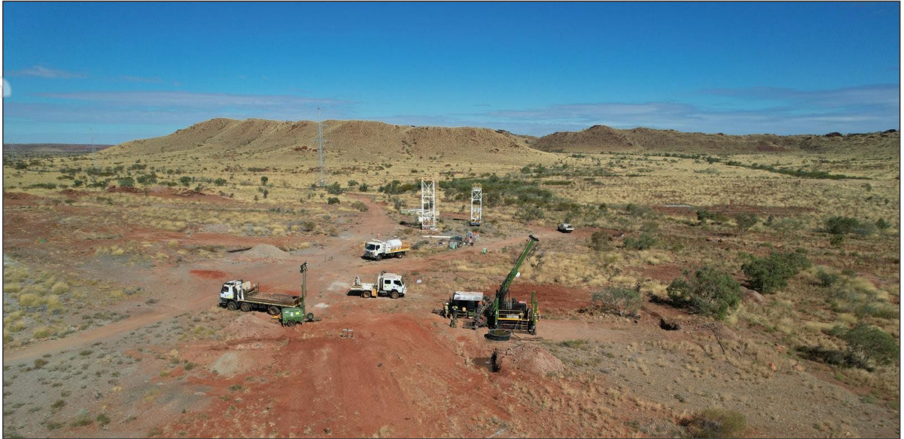
Figure 1 - West Core drill rig on site at Elizabeth Hill

All drill core will be transported from site and logged at the Company's offices and core yard in Karratha , where preliminary pXRF analysis will be undertaken. The geological team will also carry out detailed structural interpretation , which will fast-track updates to the drill program to ensure optimal targeting and program efficiency as drilling progresses.