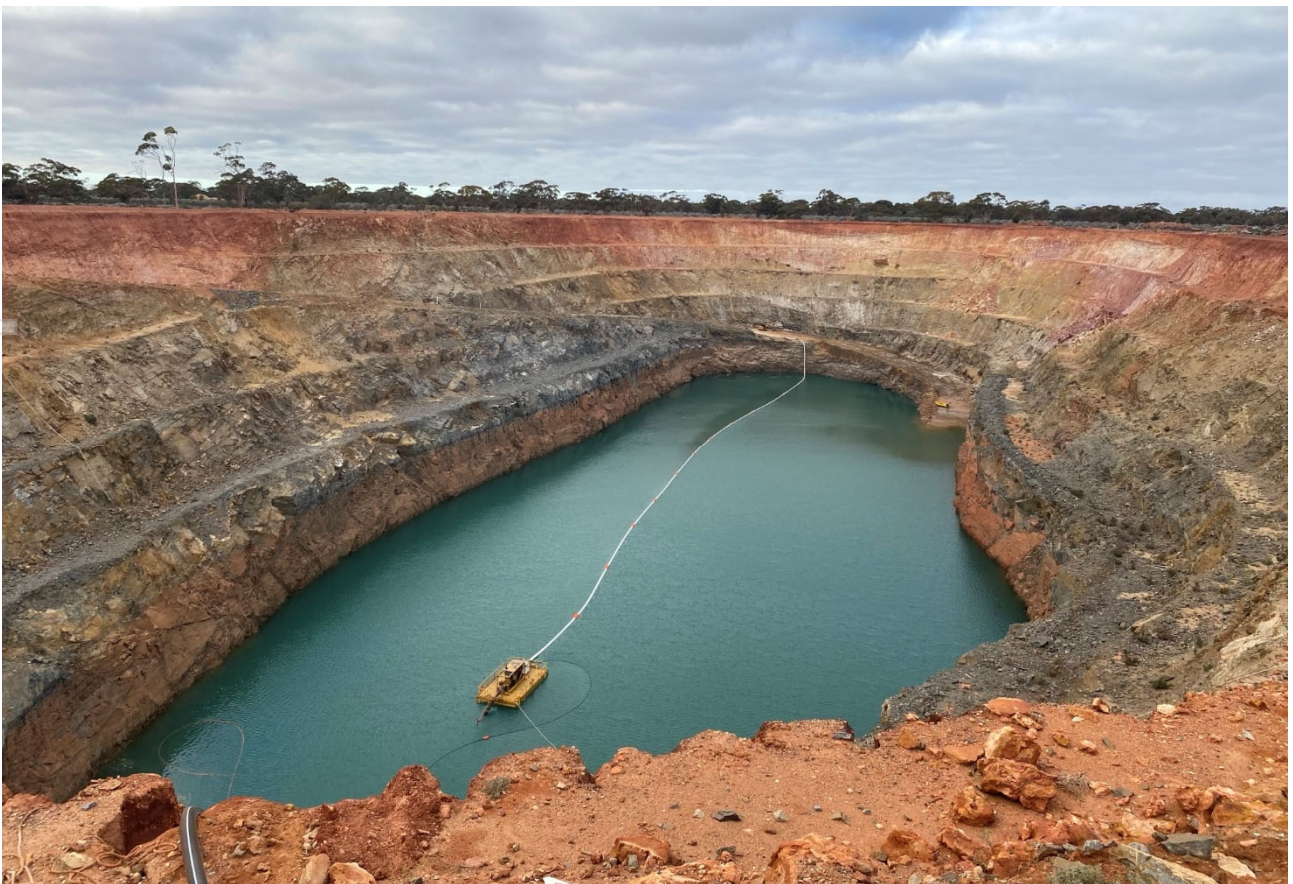
Figure 2: Dewatering infrastructure has been installed at Majestic ahead of portal development.