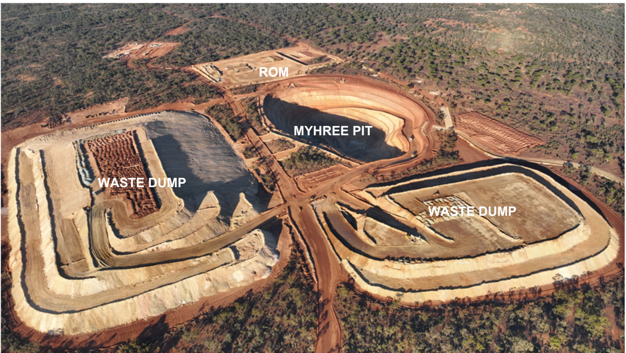
Figure 4: Myree open pit (looking south) has been mined to 310mRL with rehabilitation underway on the eastern waste dump.