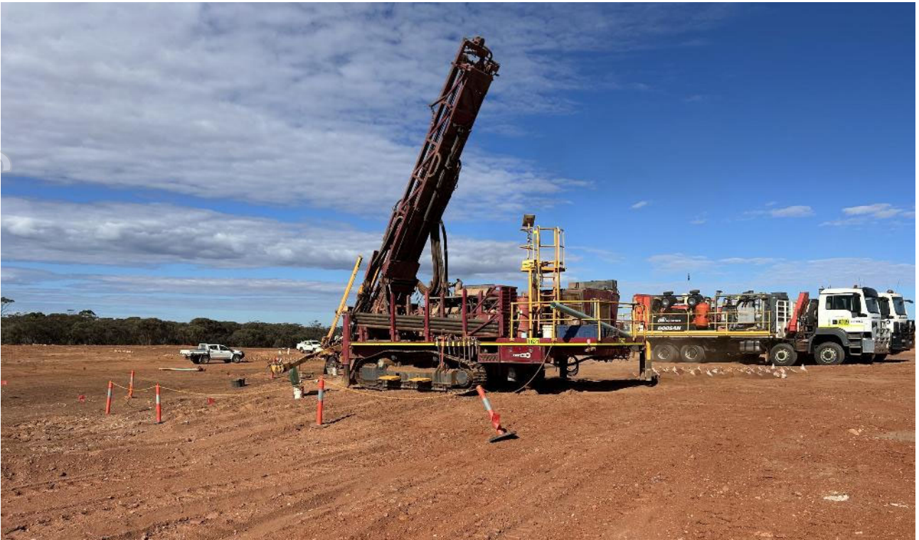
Figure 3: Grade control drilling at Fingals is underway, concurrent with hydrogeological studies for future expansion of the pit.