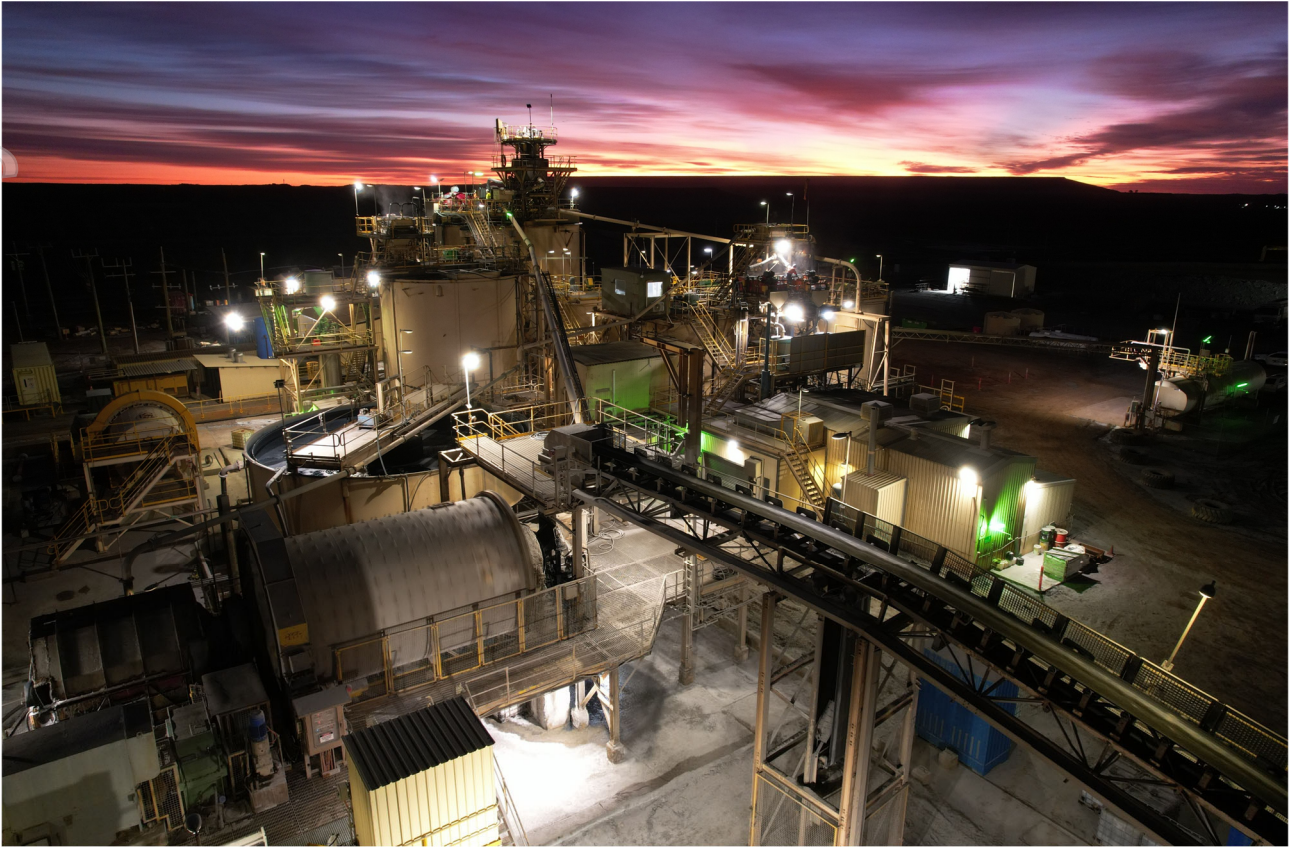
Figure 1: Lakewood processing facility is performing well.