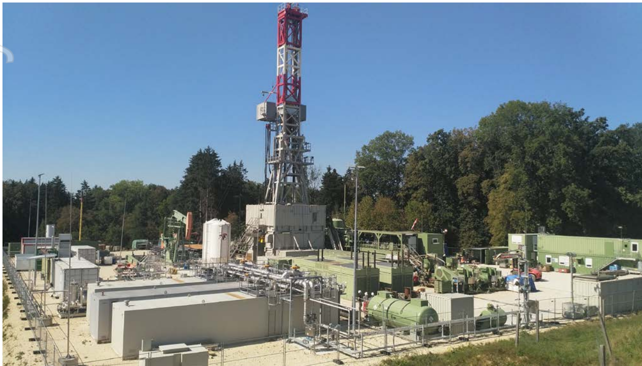
Figure 2: Recent drilling operations on the Anshof-2A appraisal well alongside the Anshof-3 production well at the Anshof Permanent Production Facility location