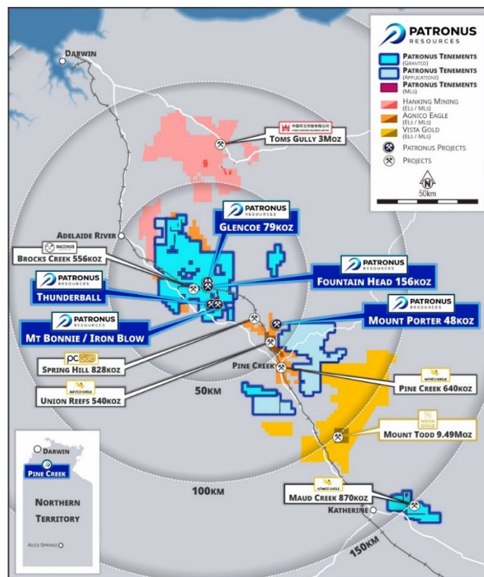
Figure A2 – Regional overview showing PTN tenure in relation to neighbouring projects in the NT.