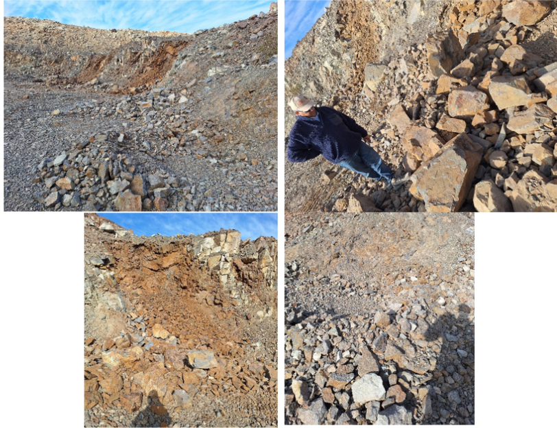
Images 2a-2d: the Four (4) Locations in the Open Pit where the 10t of material was taken from (approx 2.5t per area).