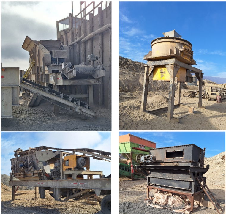
Images 2e-2h: The 3-stage crushing process and Magnetic drum used to produce bulk sample