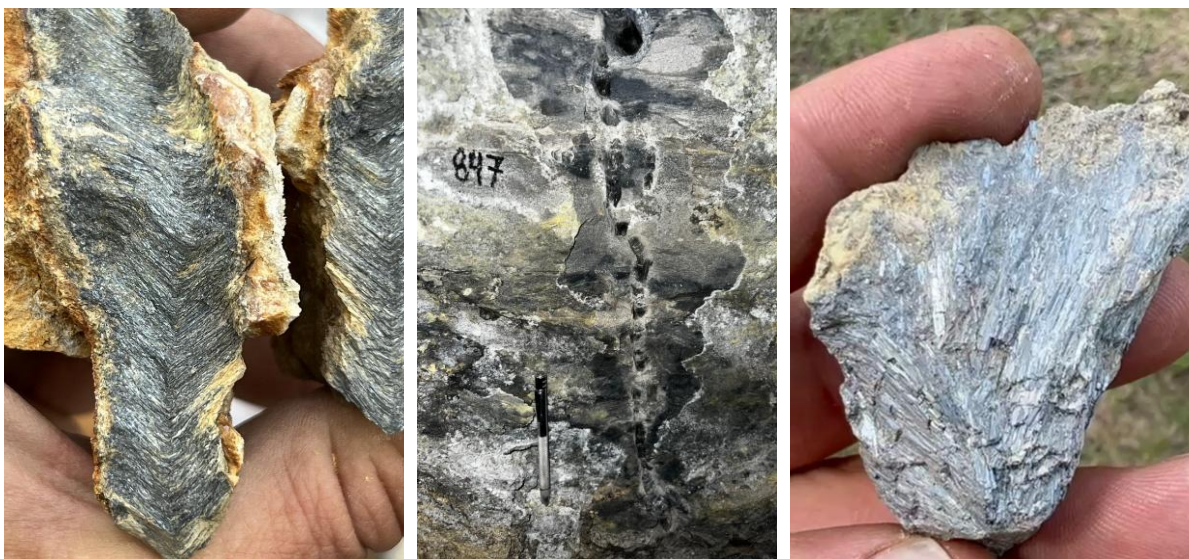
Figure 1: View of the Antimony Canyon Project area (looking northwest). Samples from within the Canyon for illustrative purposes only in support of field observations. No assays are available.